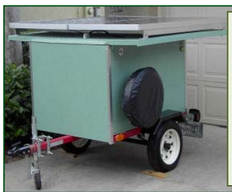
Portable electricity generators equipped with photovoltaic panels and batteries can be used to power investigative equipment such as chilling or heating units.

Procurement of goods and services offers other opportunities for conserving natural resources: