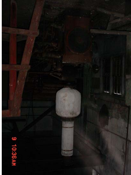
SITE: Quincy Smelter DATE: December 9, 2004 SUBJECT: ACM valve wrap on machine on the floor of the north room of Building 17. PHOTO NO: 23 DIRECTION: East