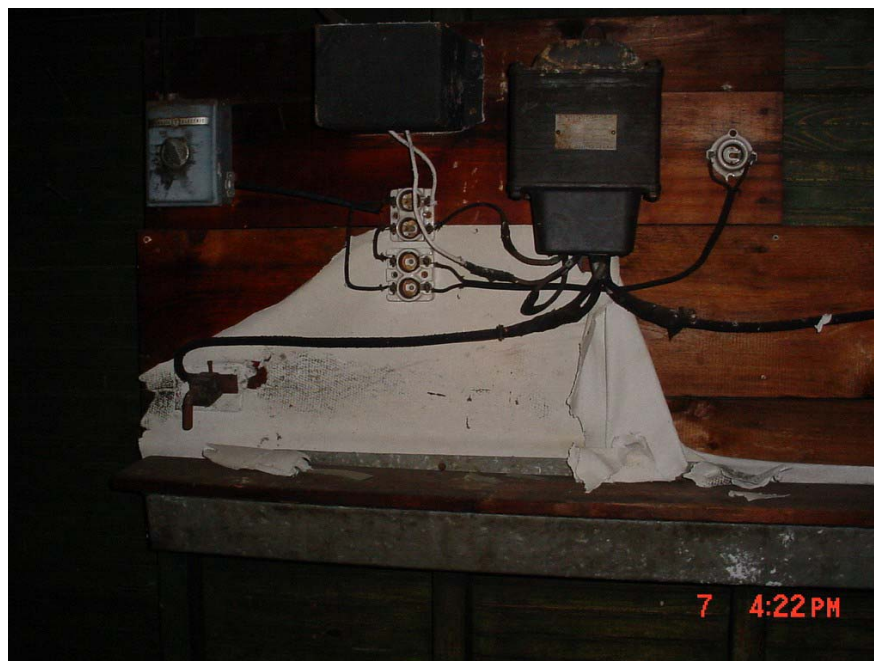
SITE: Quincy Smelter DATE: December 7, 2004 SUBJECT: ACM paper/heat shield on east wall of northwest room of Building 3. PHOTO NO: 8 DIRECTION: East