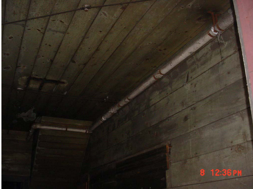
SITE: Quincy Smelter DATE: December 8, 2004 SUBJECT: ACM pipe wrap at elevation along south interior wall of the north room of Building 24. PHOTO NO: 20 DIRECTION: Southeast