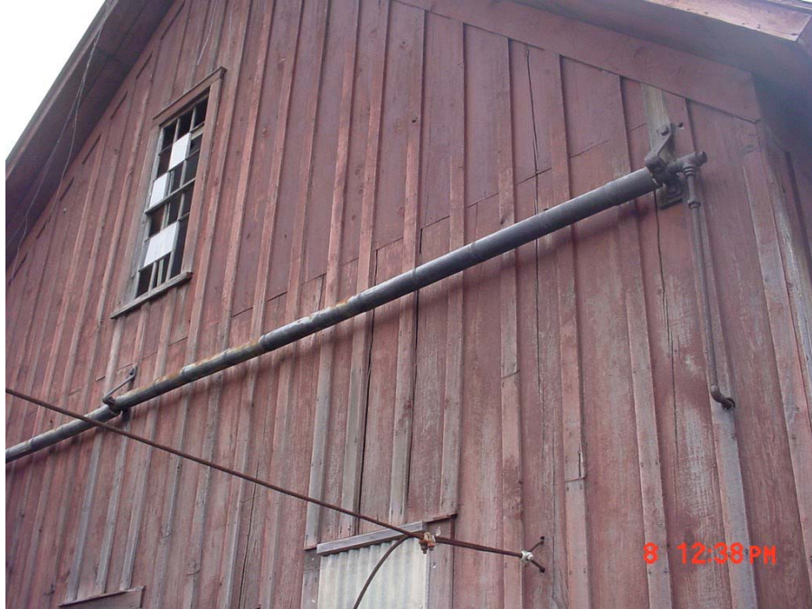
SITE: Quincy Smelter DATE: December 8, 2004 PHOTO NO: 21 DIRECTION: Southwest

SUBJECT: ACM pipe wrap at elevation along north exterior wall of Building 24.