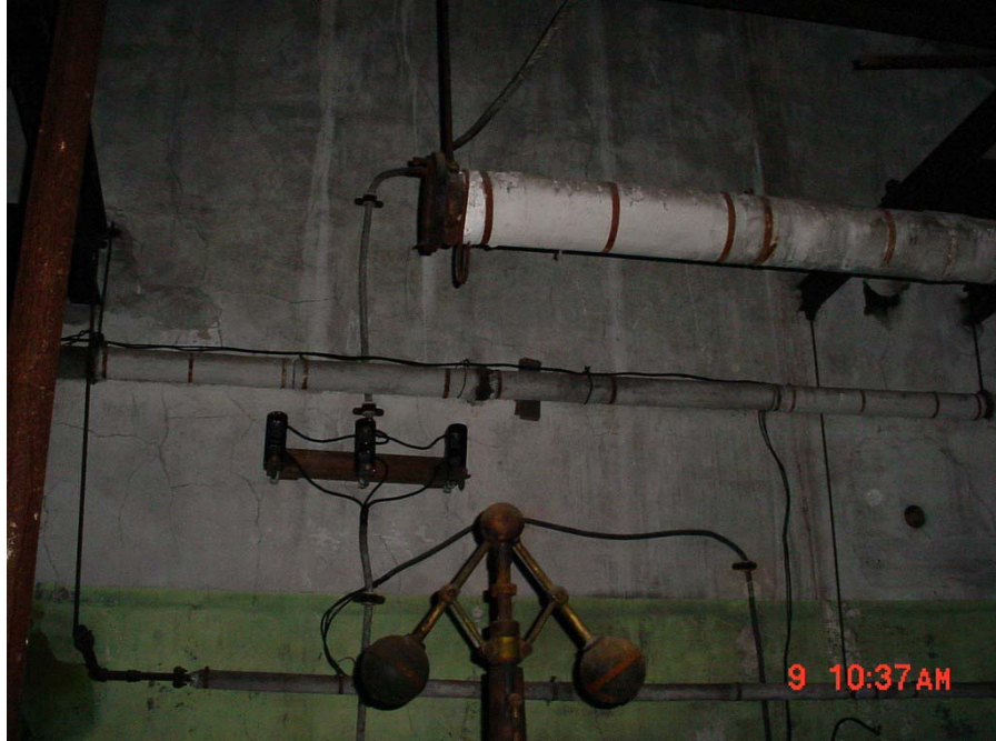
SITE: Quincy Smelter DATE: December 9, 2004 SUBJECT: Several runs of ACM pipe wrap along south interior wall of the north room of Building 17. PHOTO NO: 24 DIRECTION: South