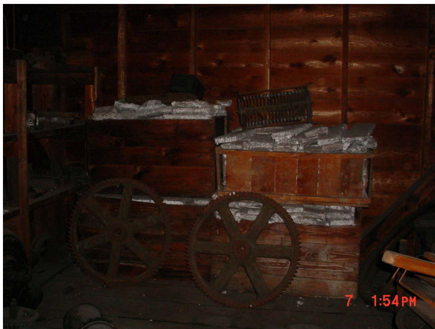
SITE: Quincy Smelter DATE: December 7, 2004 SUBJECT: ACM insulation in crates at south end of second floor loft of Building 2. PHOTO NO: 7 DIRECTION: East