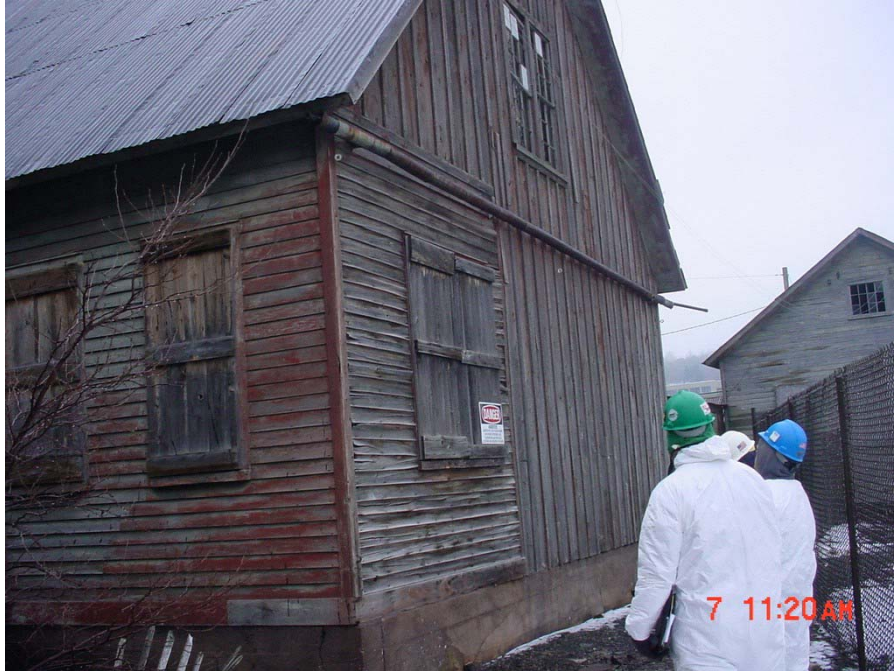
SITE: Quincy Smelter DATE: December 7, 2004 SUBJECT: Exterior, west side of Building 11. ACM PHOTO NO: 1 DIRECTION: Southeast pipe wrap at elevation along wall.