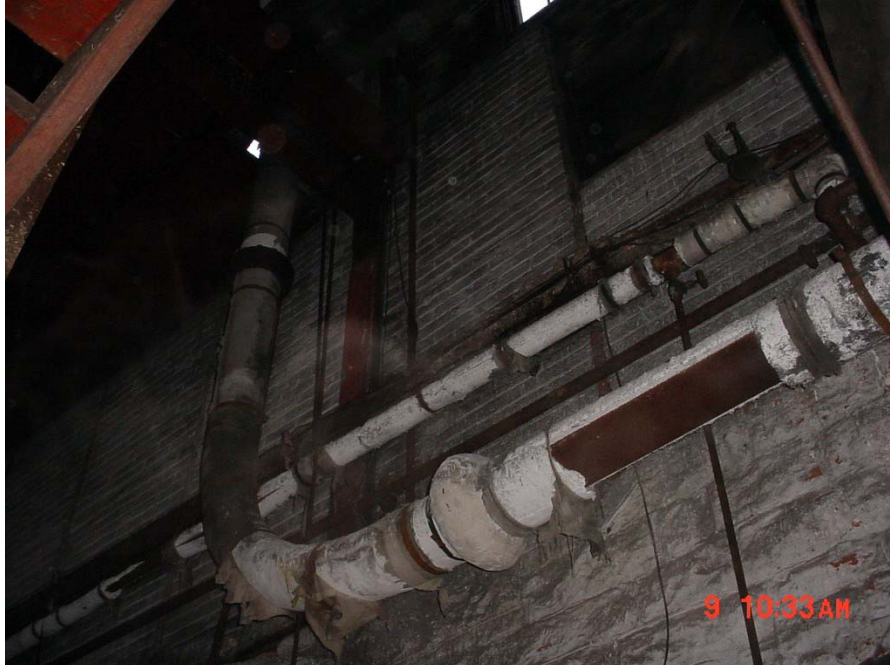
SITE: Quincy Smelter DATE: December 9, 2004 PHOTO NO: 22 DIRECTION: Up, North

SUBJECT: ACM pipe wrap at elevation along north exterior wall of Building 24.