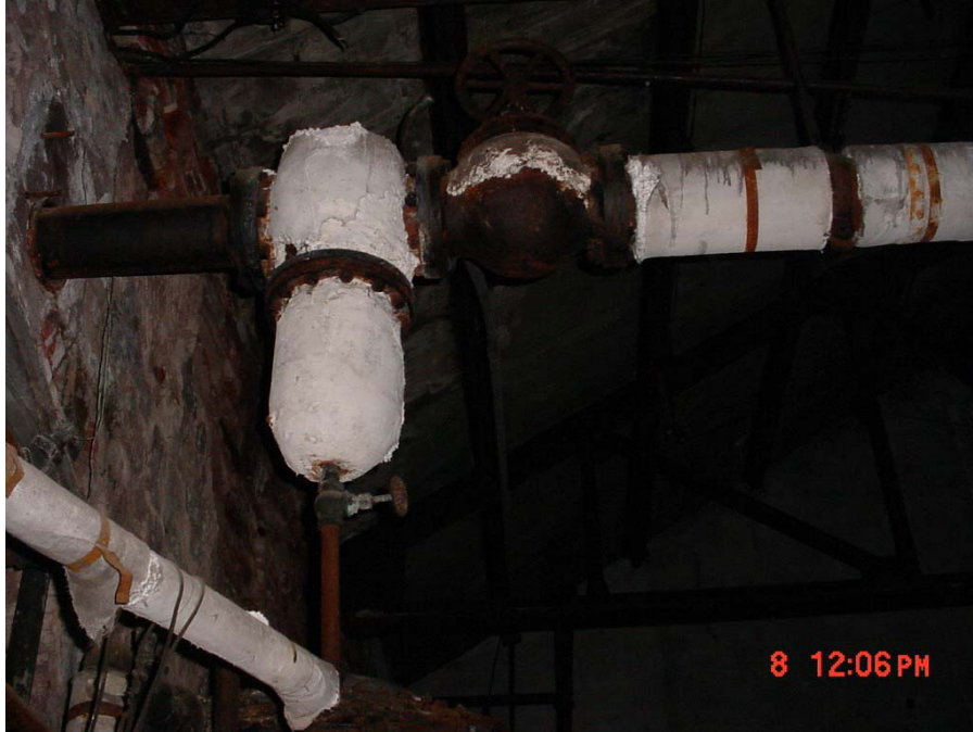
SITE: Quincy Smelter DATE: December 8, 2004 SUBJECT: ACM pipe and valve wrap along west wall of Building 17, north room. PHOTO NO: 19 DIRECTION: North