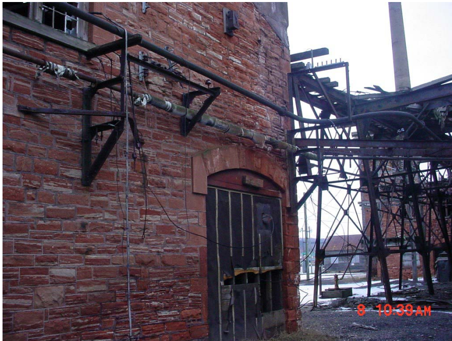
SITE: Quincy Smelter DATE: December 8, 2004 PHOTO NO: 13 DIRECTION: Southwest PHOTOGRAPHER: S. Meyer

SUBJECT: ACM pipe wrap at elevation along north exterior wall of Building 7.