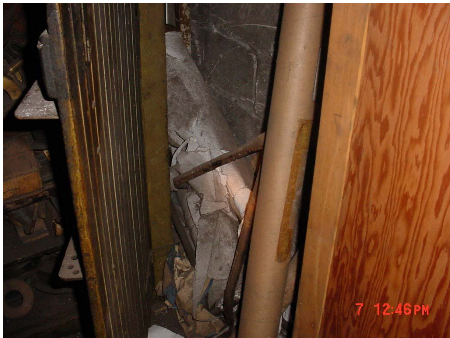
SITE: Quincy Smelter DATE: December 7, 2004 SUBJECT: ACM paper on floor in second-floor loft of PHOTO NO: 2 DIRECTION: Northeast Building 20.