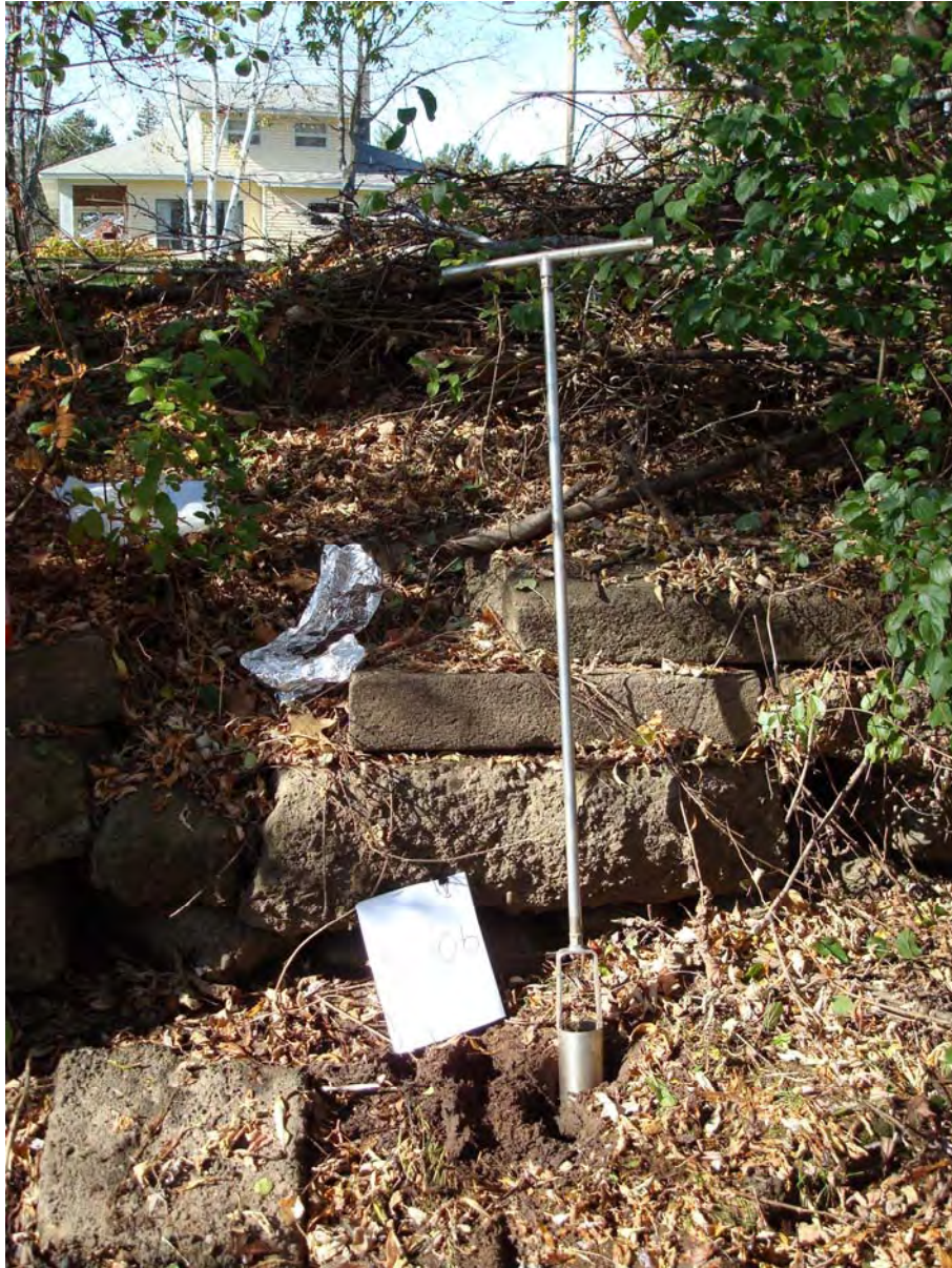
October 19, 2010 SS-6 sampling at the end of Oak Street