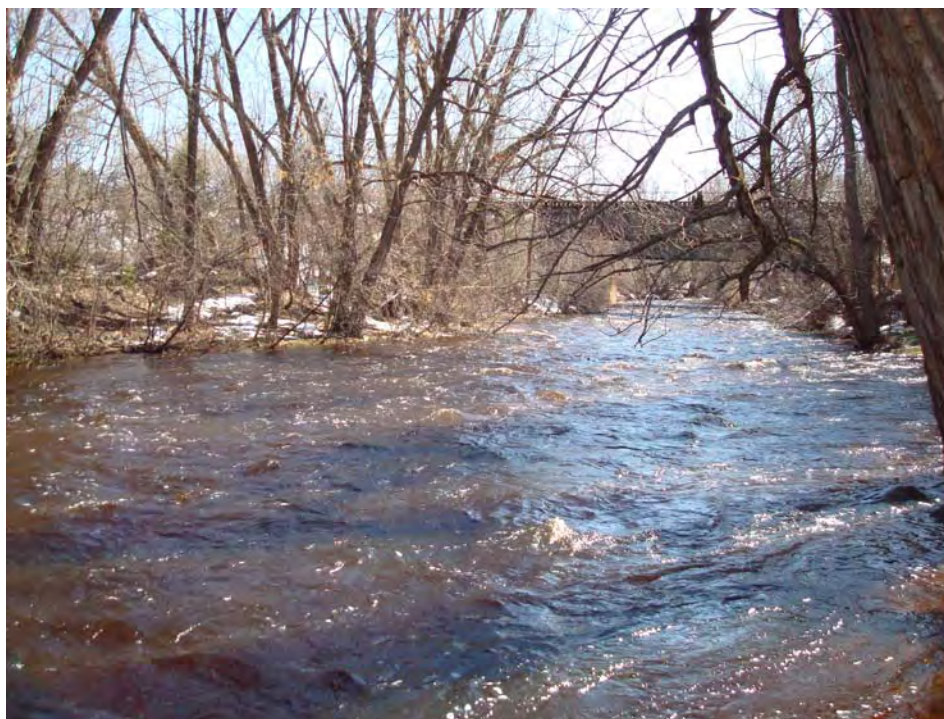
March 17, 2010 - High river flow along Montreal River