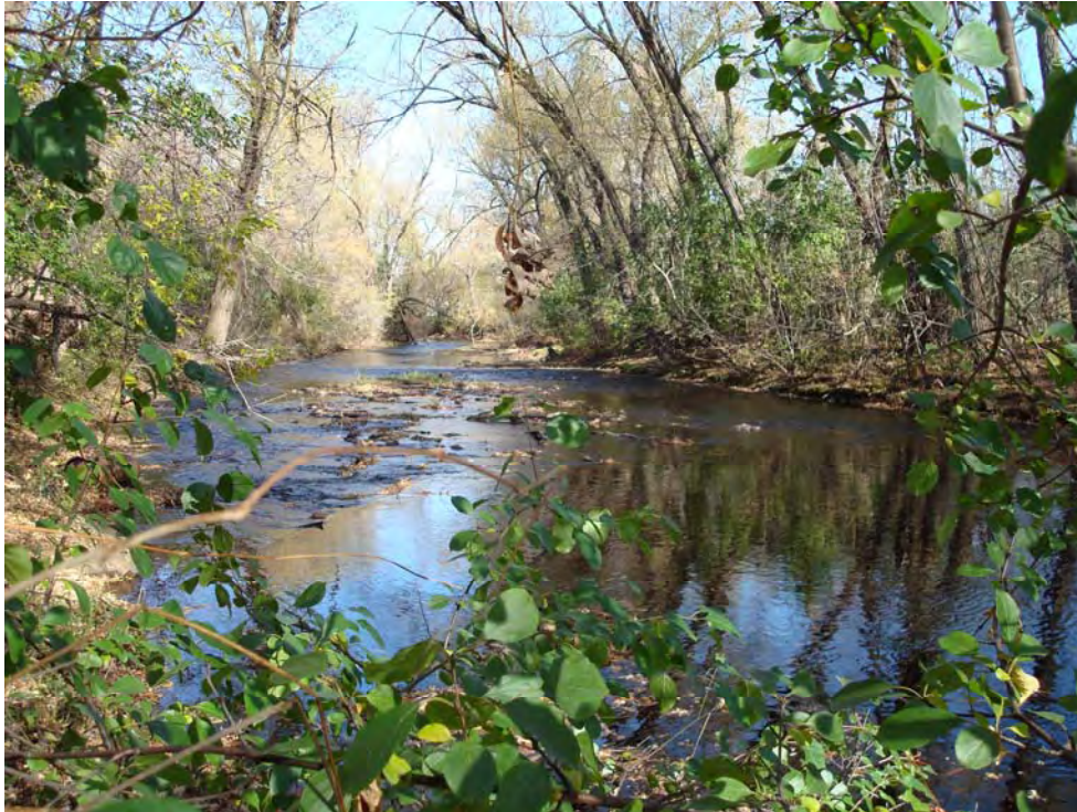
October 19, 2010 - Montreal River flow during the Fall.