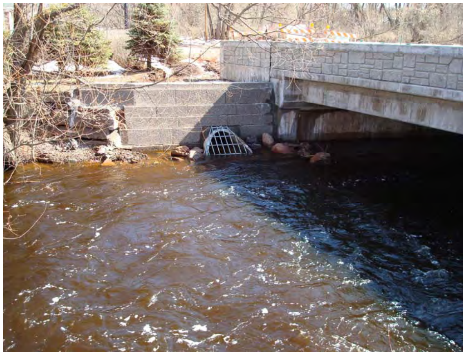
March 17, 2010 – Reconstructed Poplar Street Bridge