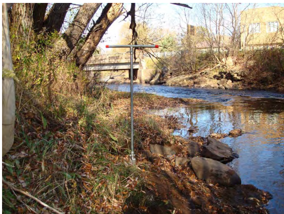
October 19, 2010; SS-1 sampling location south of Silver Street