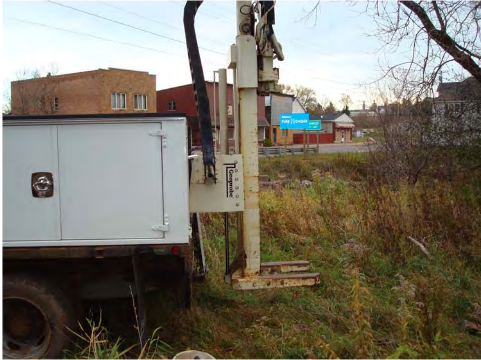
October 20, 2010; SS-4 & WMW-1 sampling location south of Silver Street