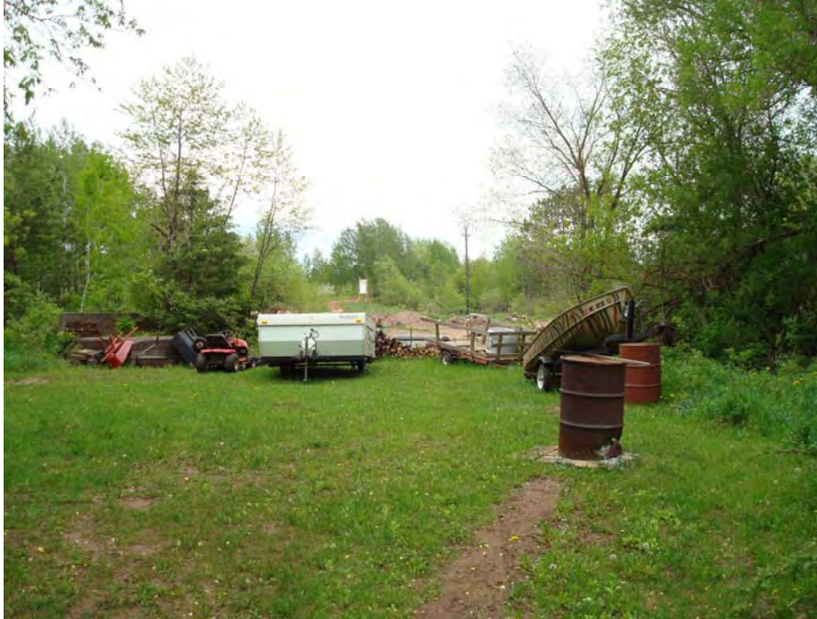
July 7, 2010 – Residential Property in Wisconsin adjacent Montreal River