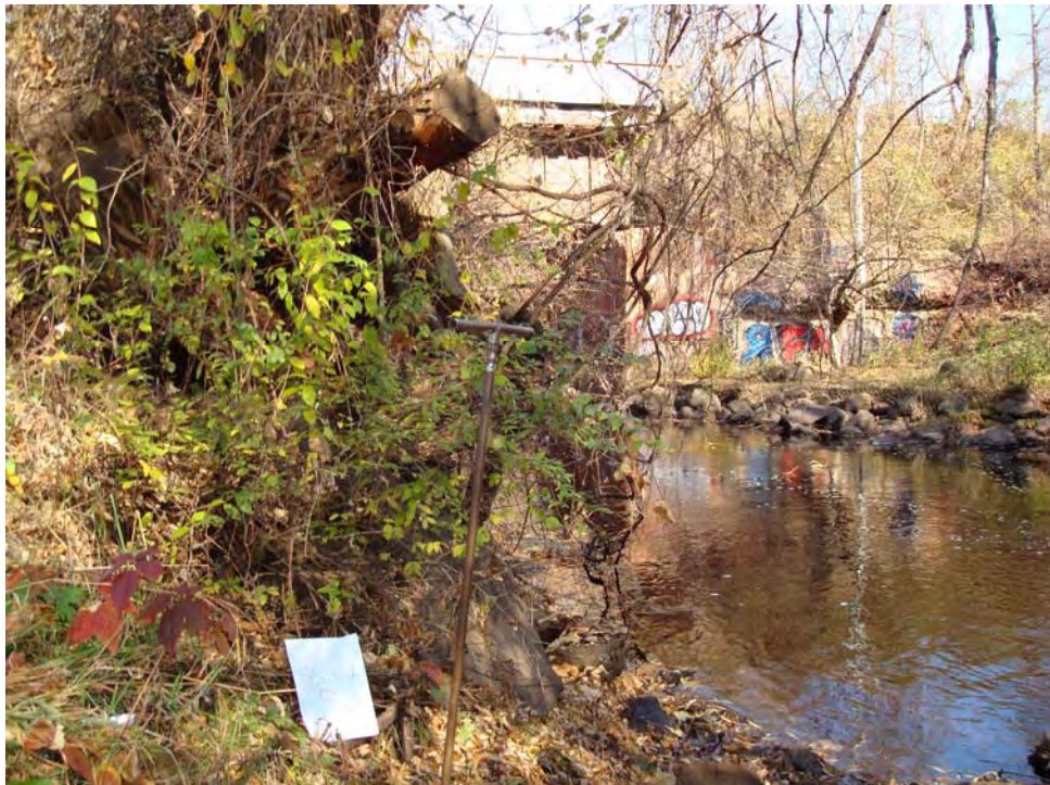
October 19, 2010; SS-2 sampling location at the end of 1 st Street