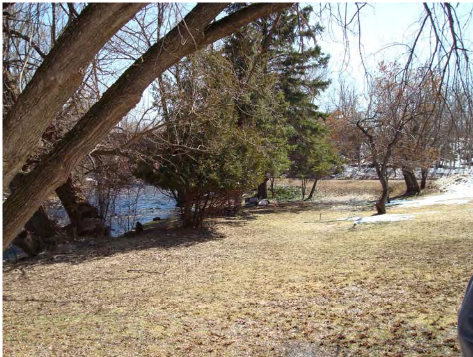
March 17, 2010 – Residential Property in Wisconsin adjacent Montreal River