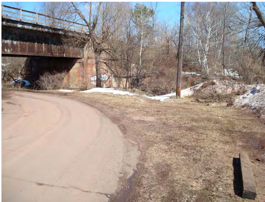
March 17, 2010 – Property in Wisconsin (end of 1 st Street) directly across Montreal River from Ironwood MGP site