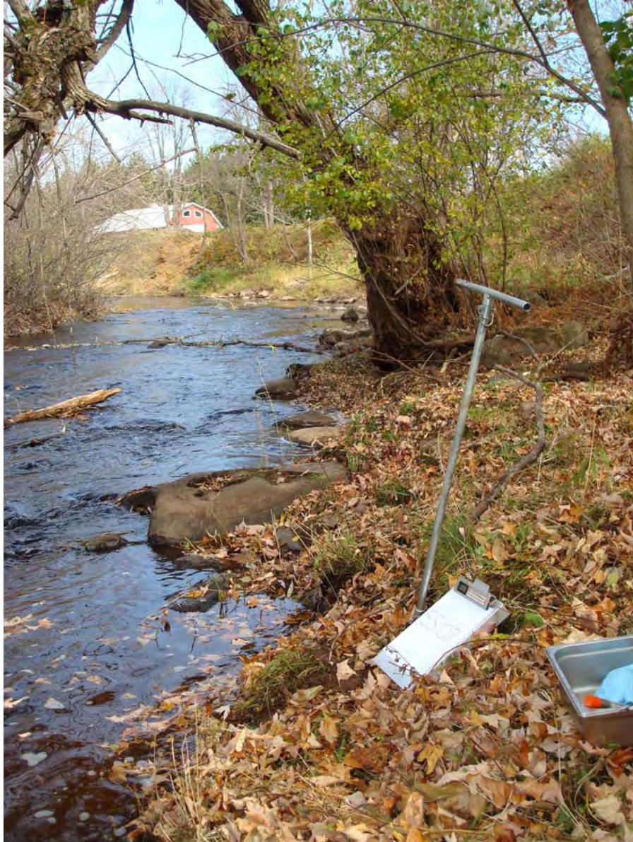
October 19, 2010; SS-7 & SS-8 soil sampling location at the end of Riverside Drive.