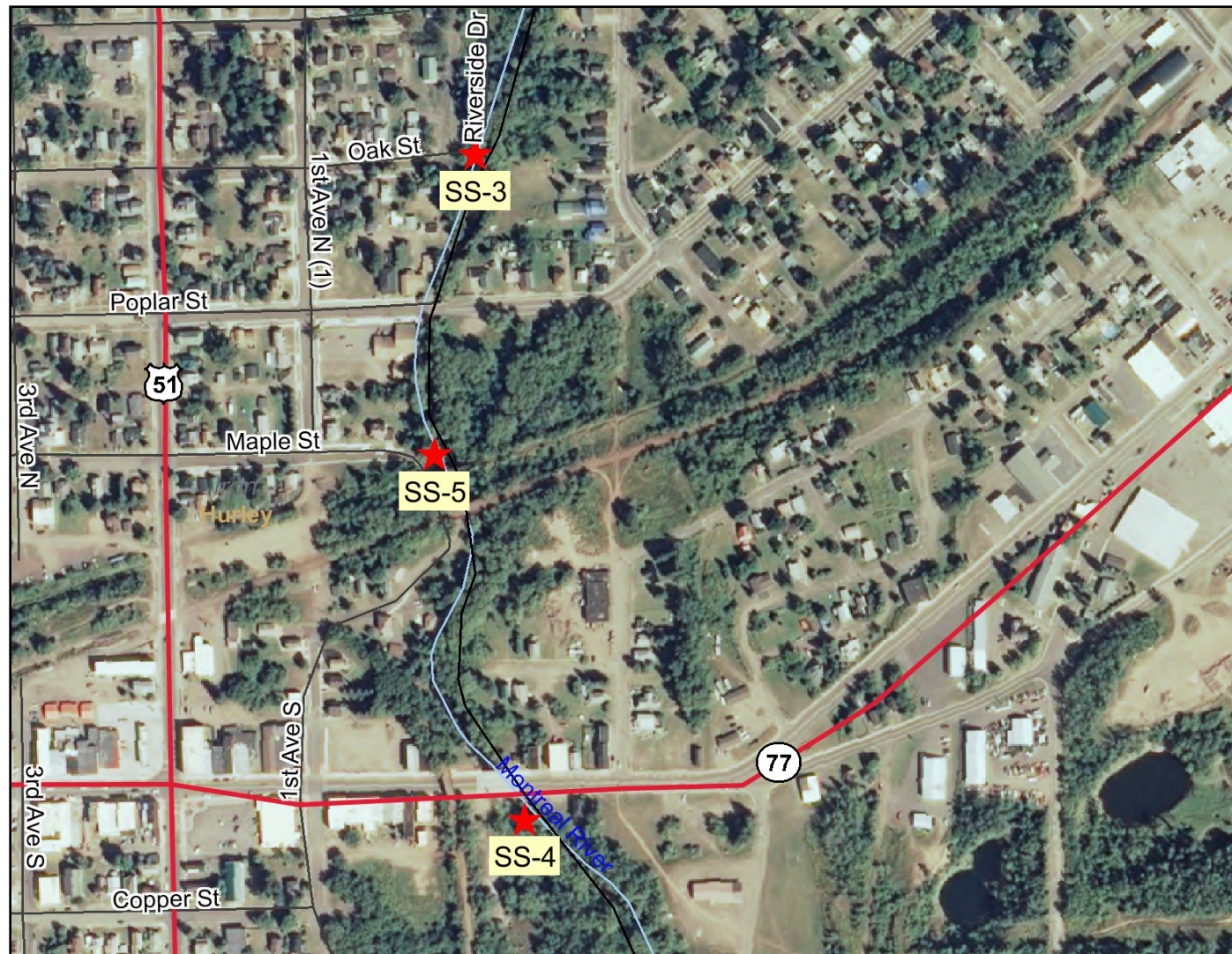
Figure 3b - Geoprobe Soil Sampling Locations