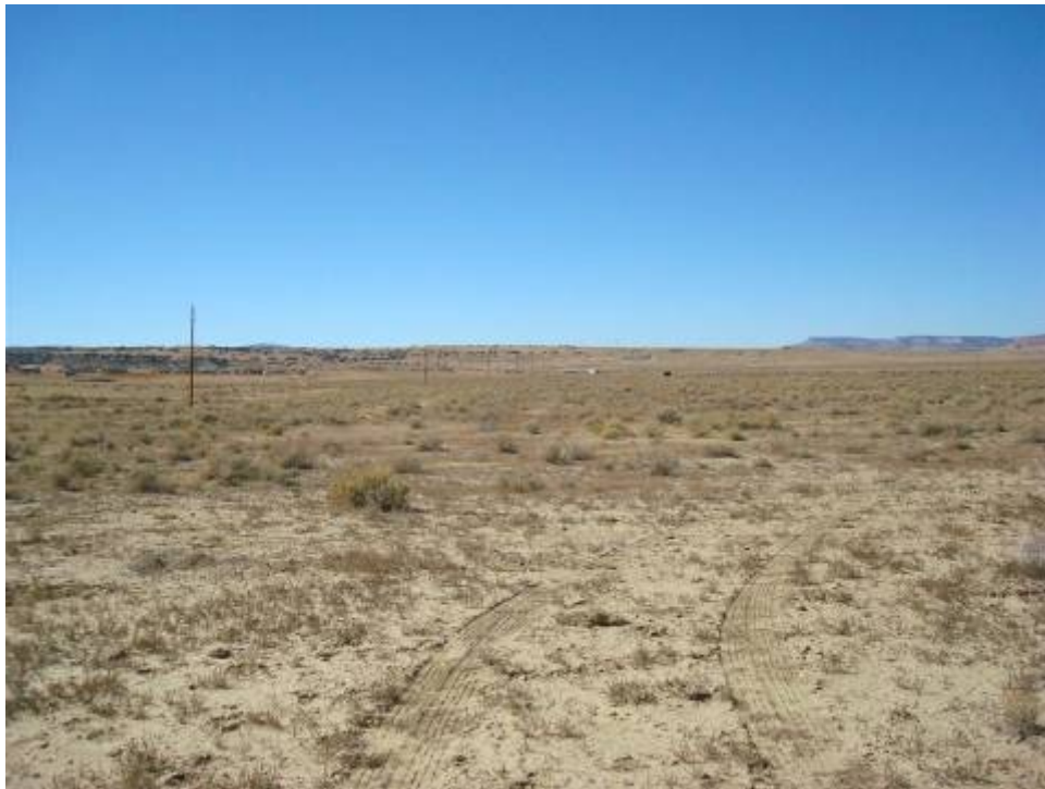
Photo 1. Section 32 Mine site, towards the west, residence in background