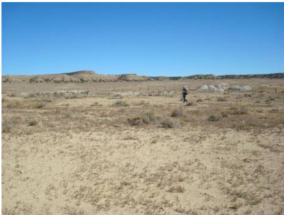
Photo 2. Section 32 Mine site, towards the south east. waste piles in background are located on adjoining Section 33 Mine site