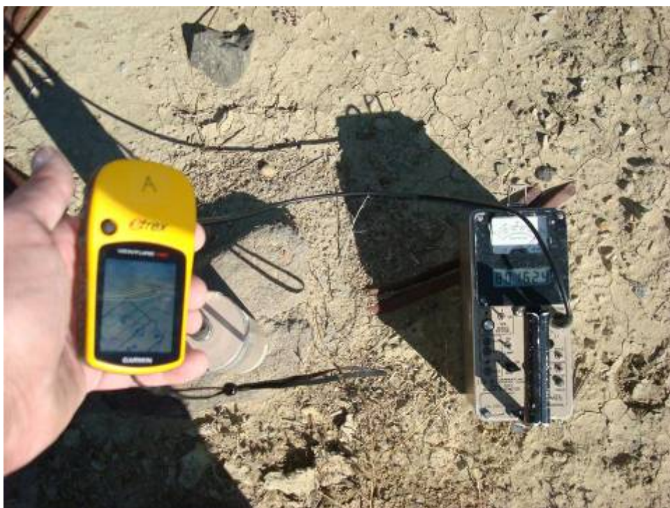
Photo 4. Section 33 Mine site, Uranium ore exhibiting over 800,000 cpm