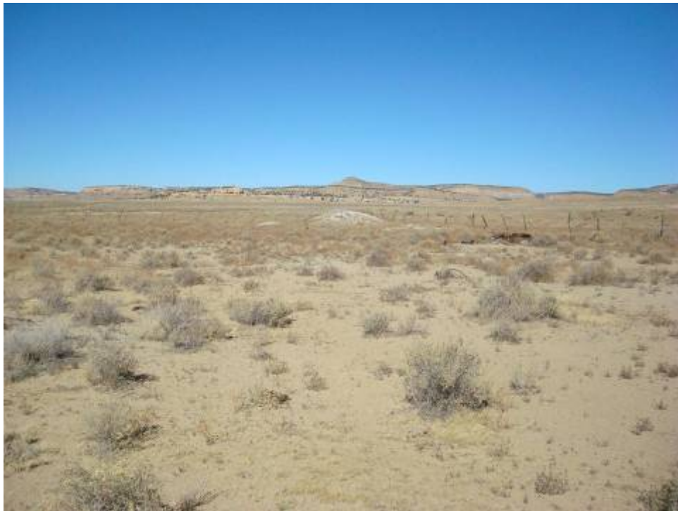
Photo 1. Section 33 Mine site, towards the north