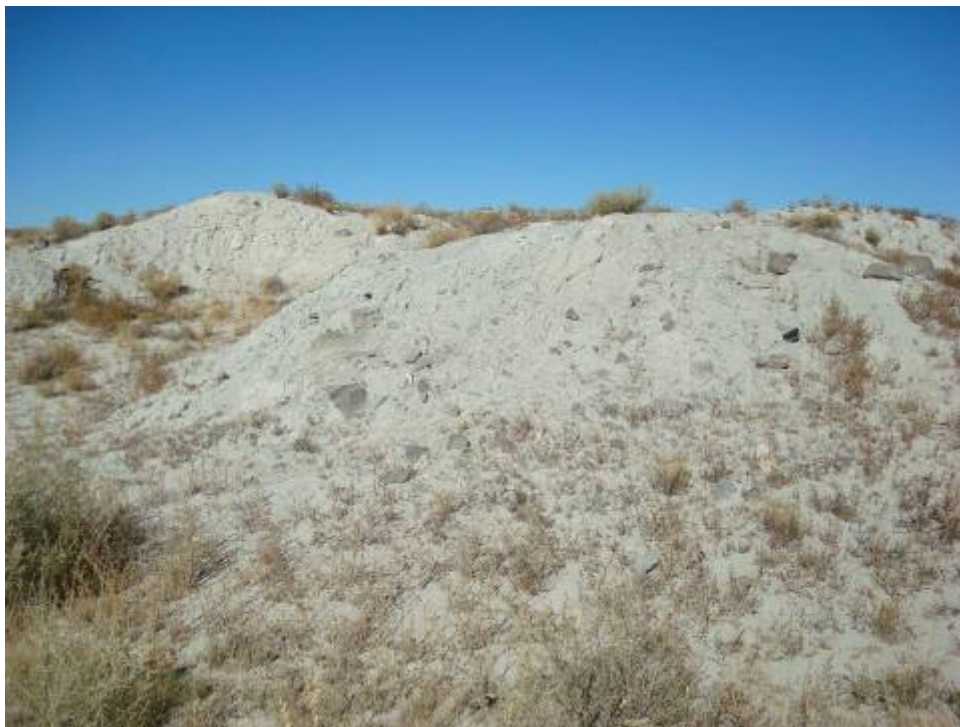
Photo 5. Section 33 Mine site, pulverized waste rock piles.