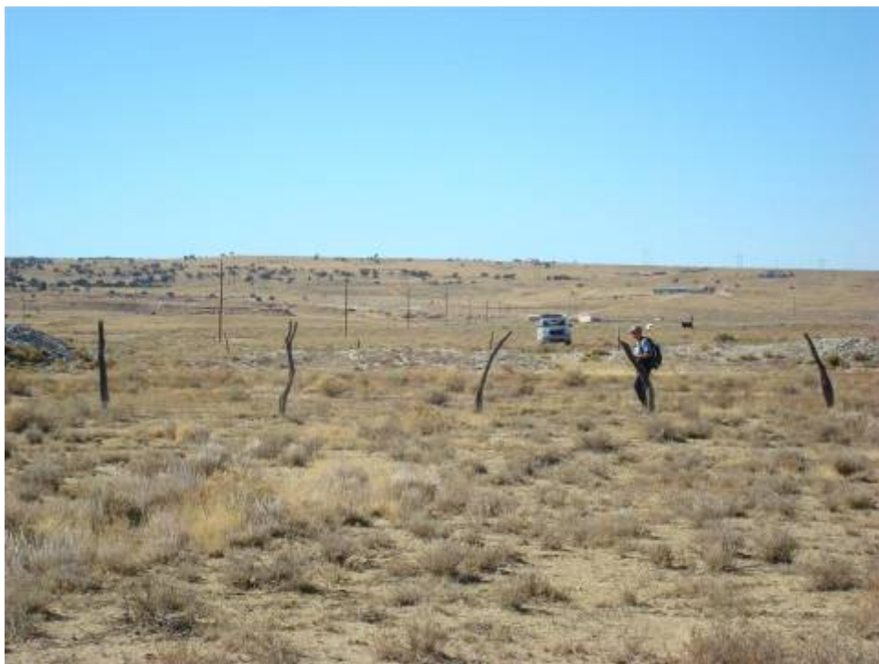
Photo 2. Section 33 Mine site, towards the west, residence in background.