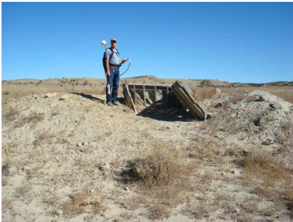
Photo 3. Section 33 Mine site, wooden hopper and pulverized waste rock pile located at southeast corner of mine