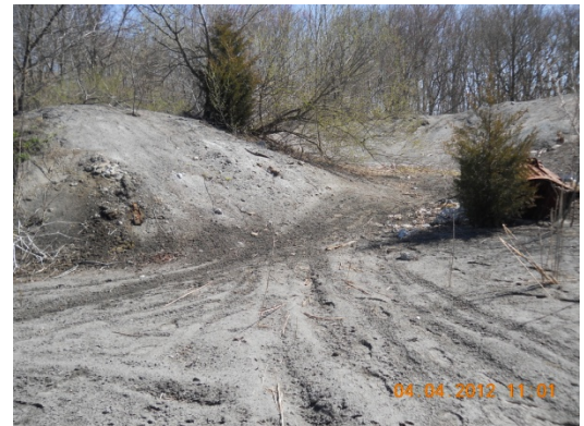
Tire tracks leading to/from pile