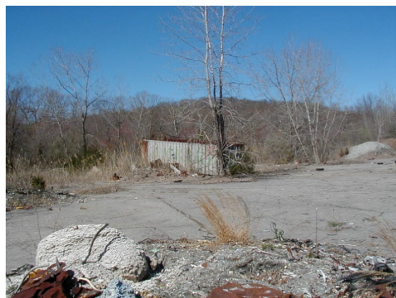
Debris (foreground), metal waste pile (background)