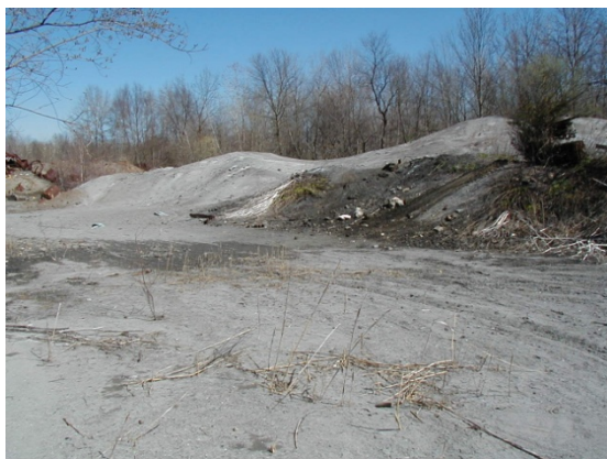
Largest metal waste pile, with tire tracks