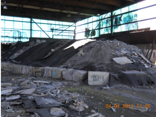
Metal waste pile partially covered with geotextile