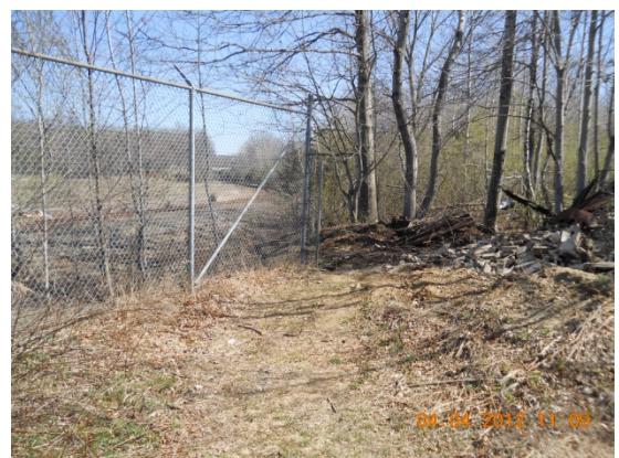
Missing portion of perimeter fence