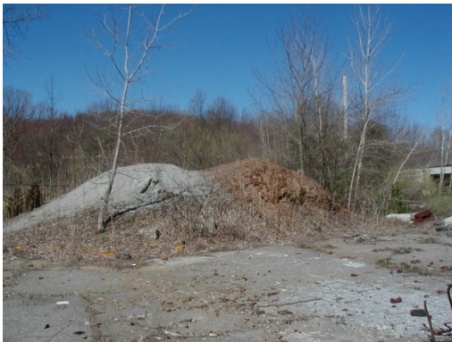
Metal waste pile