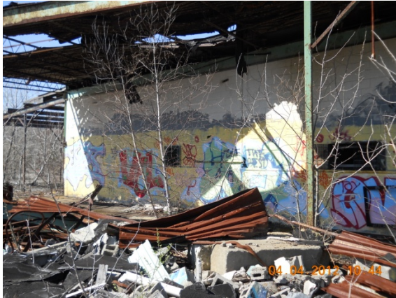
Collapsing Building, Debris Piles, Graffiti