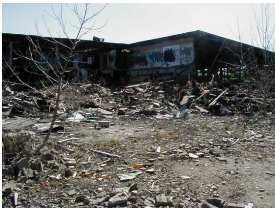
Building Collapsed After the Fire