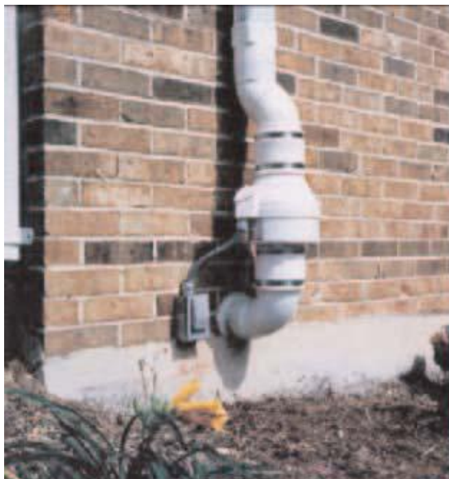
An example of a system that draws radon and other vapors out of the soil and vents them outside. It's known as a “sub-slab mitigation system.”

One way to keep harmful vapors out of your home is to make sure common household products, especially chemical- and petroleum-based products, are tightly sealed and properly stored in a well-ventilated area.