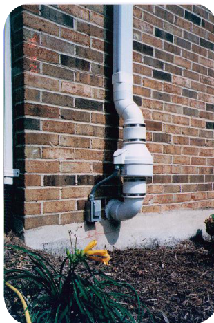
Typical fan and vent pipe.

Mitigation systems have been installed and operated at hundreds of homes near Superfund sites and other contaminated sites across the country.