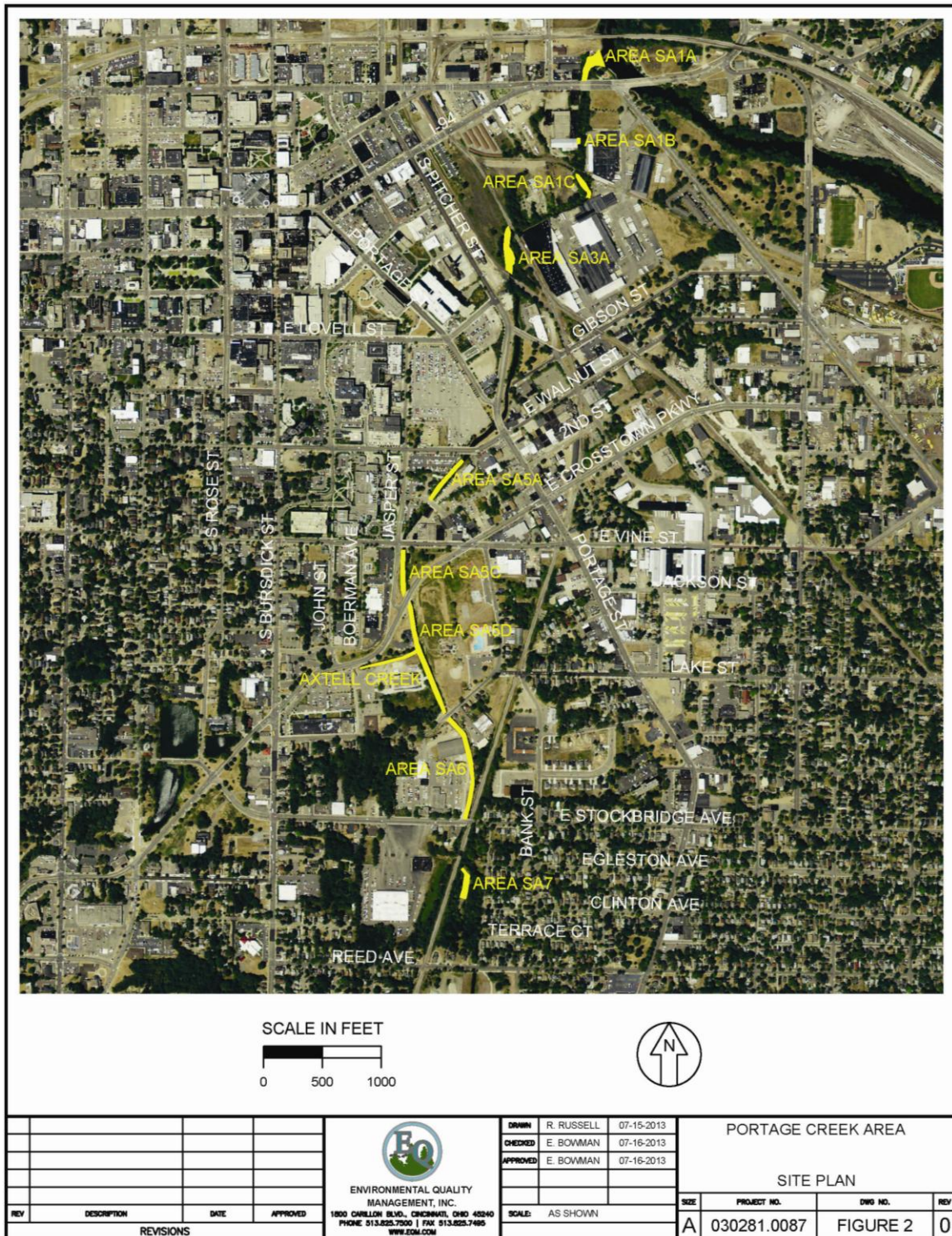
Figure 2. Site Plan