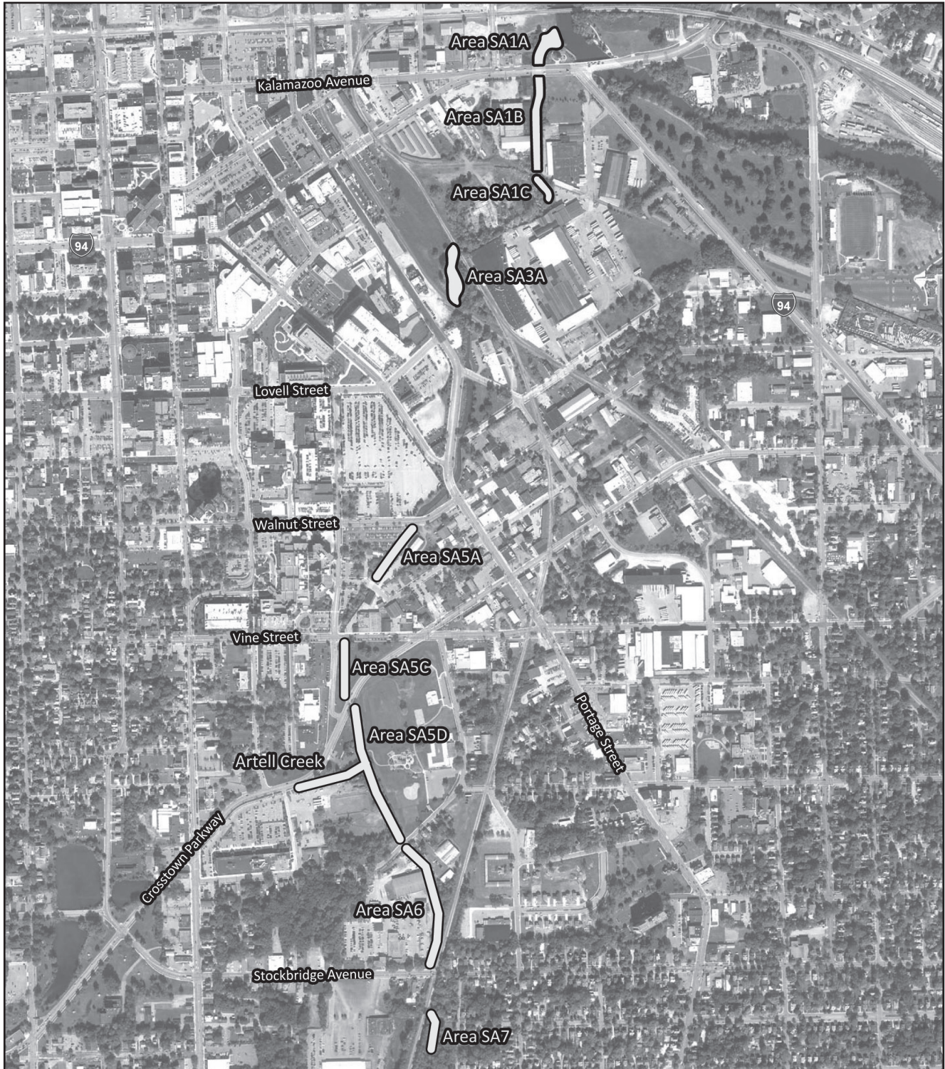
Portage Creek Removal Areas