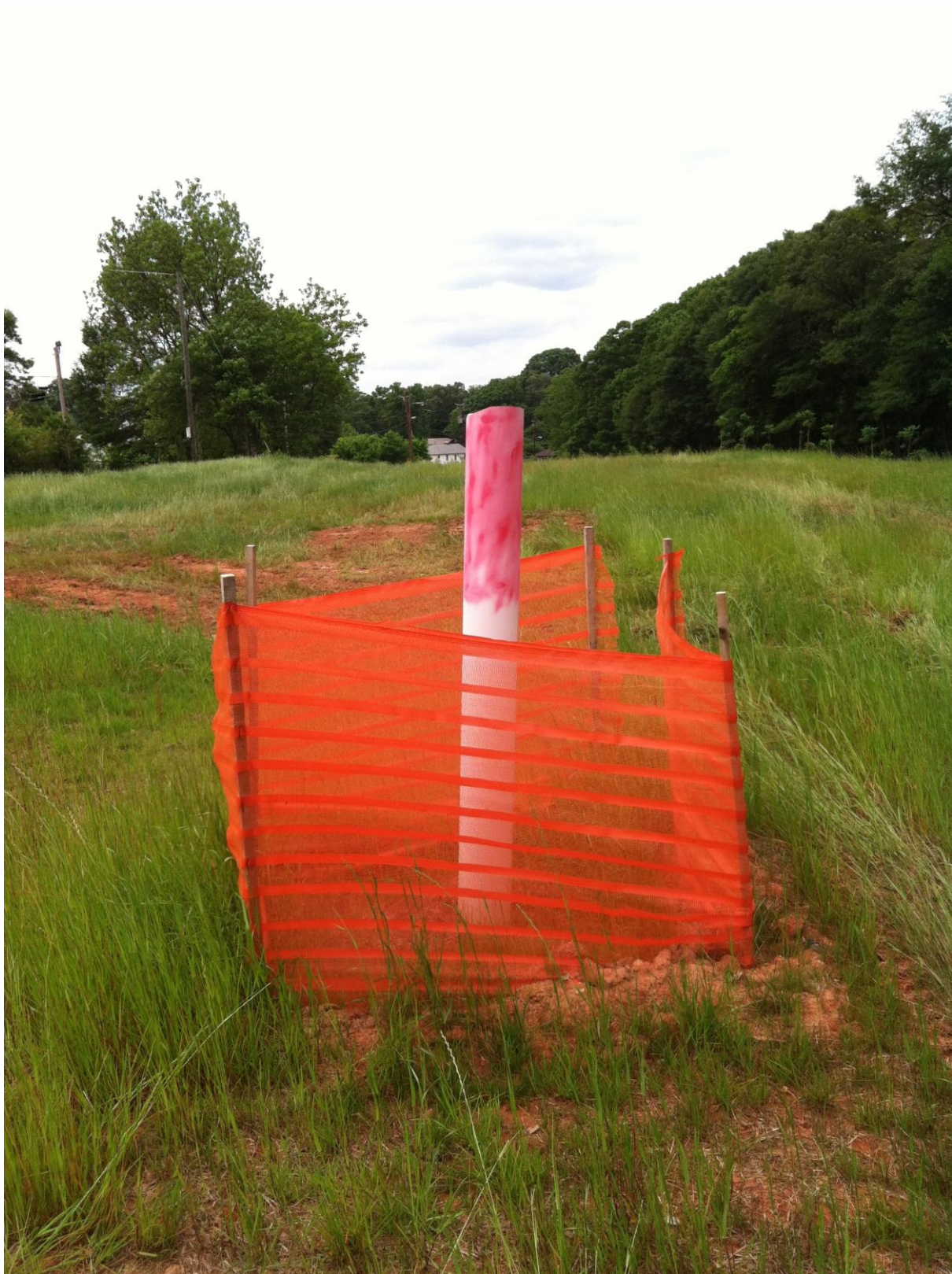
Figure 2: Photograph of the irrigation well at the Beltline Urban Agriculture site, looking north. Geographic coordinates: 33.723972, -84.413003.