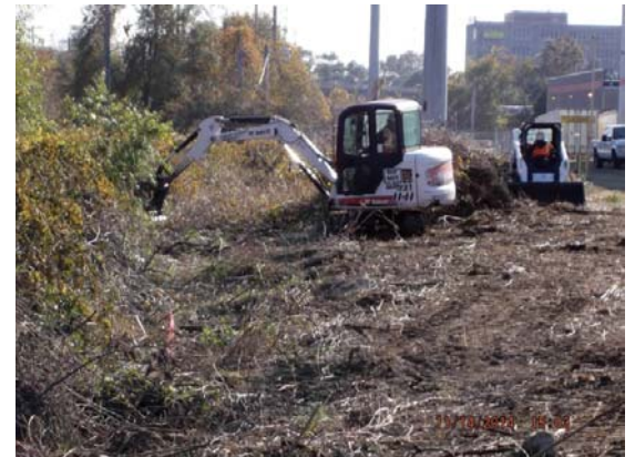
Brush Clearing at Zone M