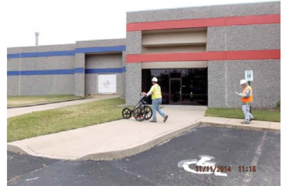
Soft Excavation Utility Clearance Survey