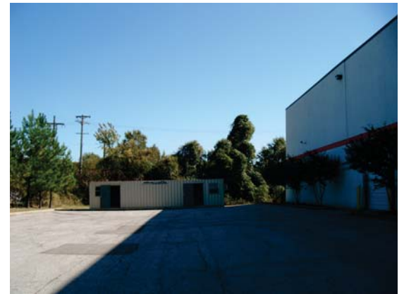
Site Office Trailer - Facing East