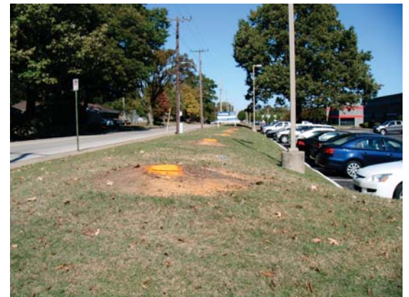
Spray Painted Tree Stumps – Facing North