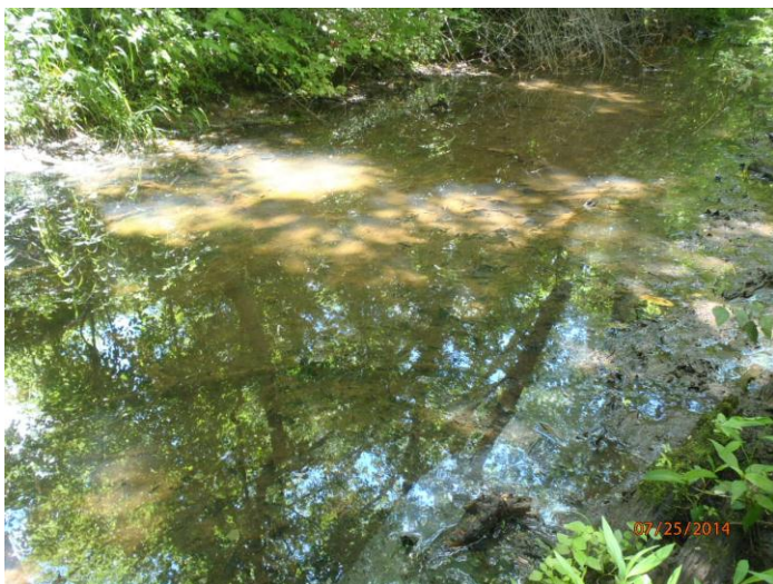
Sample collection point. Sheen slightly visible