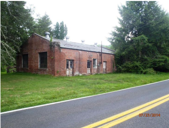
Tuscarora Oil building along River Rd. south of Ely Rd.