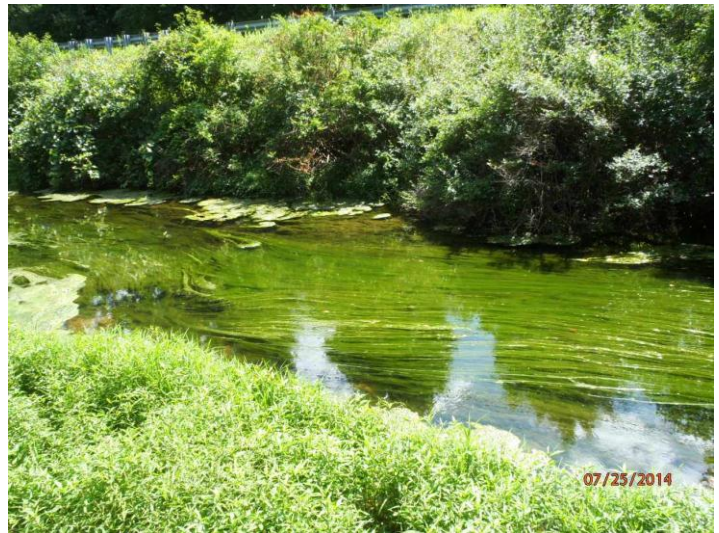
Filamentous algae in the canal opposite Ely Rd.