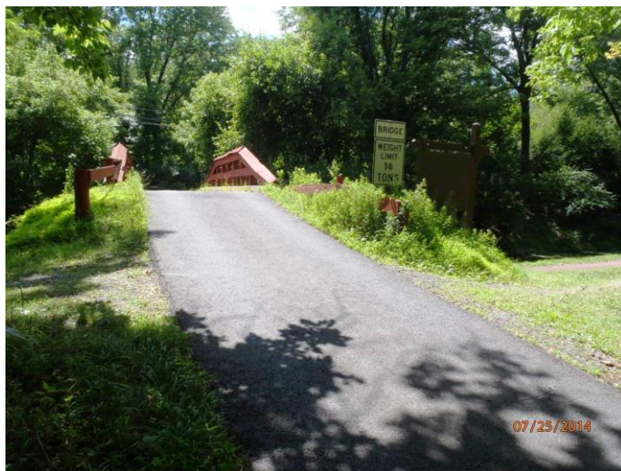
Bridge over the Canal at the County Park