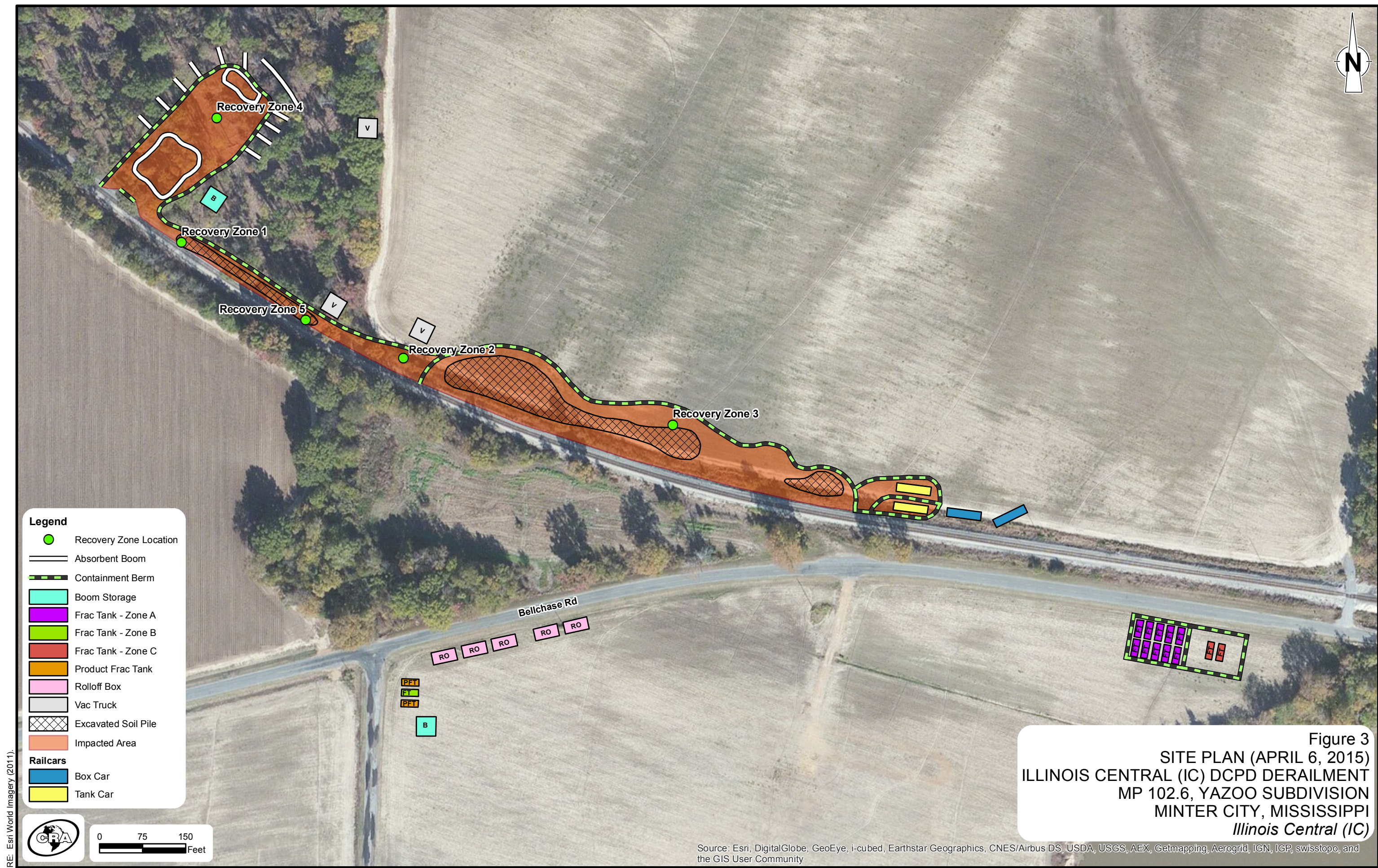
Figure 3 SITE PLAN (APRIL 6, 2015) ILLINOIS CENTRAL (IC) DCPD DERAILMENT MP 102.6, YAZOO SUBDIVISION MINTER CITY, MISSISSIPPI Illinois Central (IC)