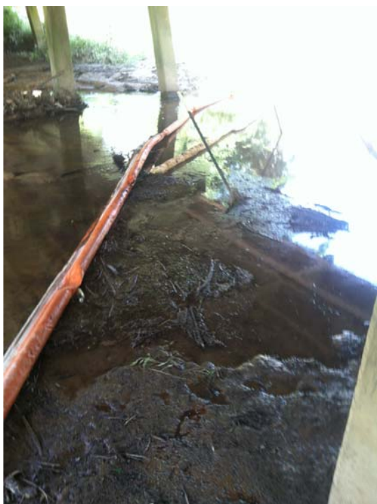
Zone B Speed Road before