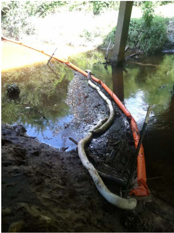
Zone C Leaf River Church Road before