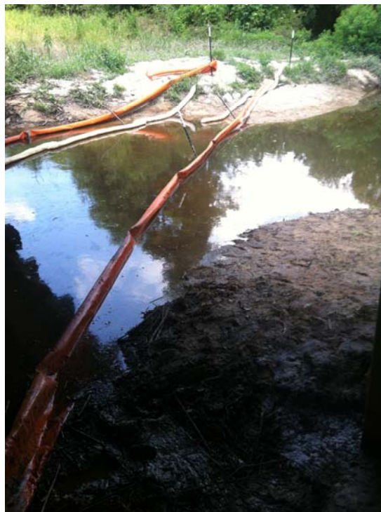
Zone B Speed Road after