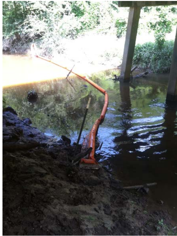
Zone C Leaf River Church Road after