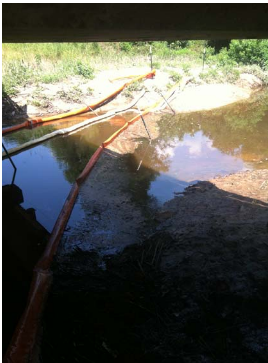
Zone B Speed Road before