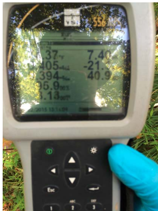
Photo No. IMG_0528; Taken on 07/22/15 at 15:27 hours by START-BH. Facing Down. YSI Meter face. Water quality measurements in stream during sampling of WG-PW-0001.