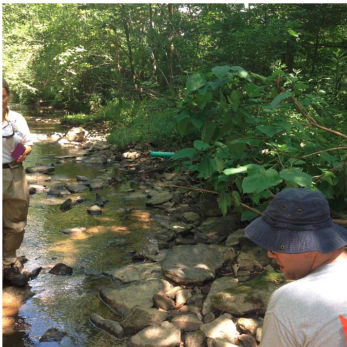
Photo No. IMG_3042; Taken on 07/22/15 at 12:19 hours by START-JW. Facing Down. Location of WG-SW-0007. Teal colored outfall PVC pipe noted downstream from sample location.