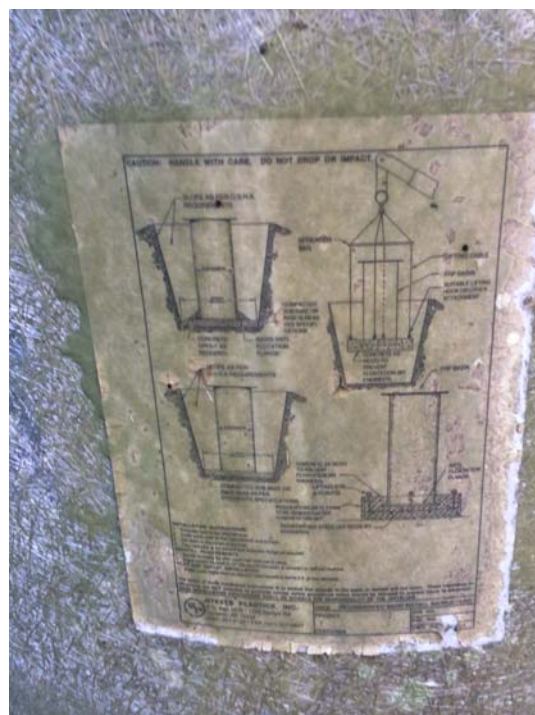
Photo No. IMG_0525; Taken on 07/22/15 at 15:10 hours by START-BH. Facing N/A. Diagram on side of sump.