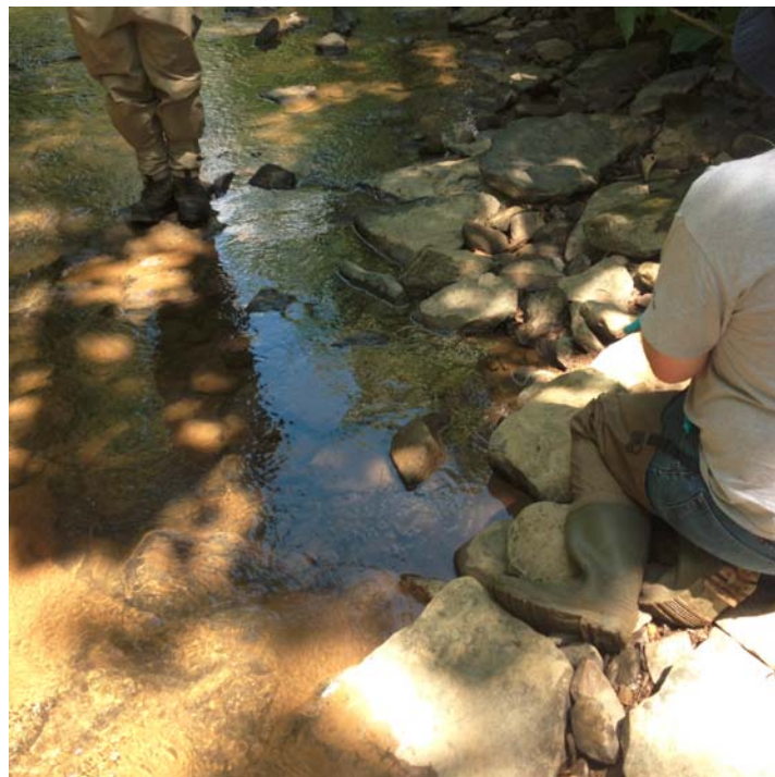
Photo No. IMG_3041; Taken on 07/22/15 at 12:19 hours by START-JW. Facing Down. Location of WG-SW-0007.