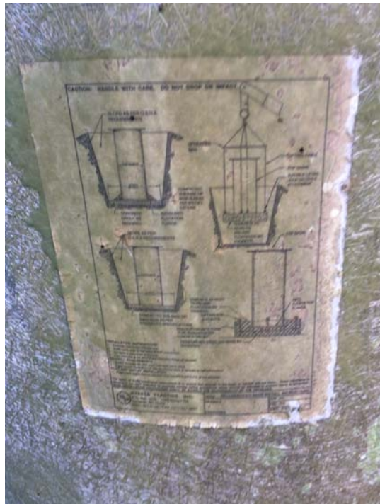
Photo No. IMG_0526; Taken on 07/22/15 at 15:10 hours by START-BH. Facing N/A. Diagram on side of sump.