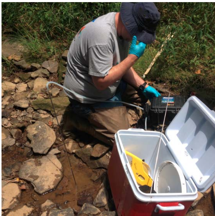
Photo No. IMG_3046; Taken on 07/22/15 at 13:27 hours by START-JW. Facing Down. START setting up for collection of sample WG-PW-0001.