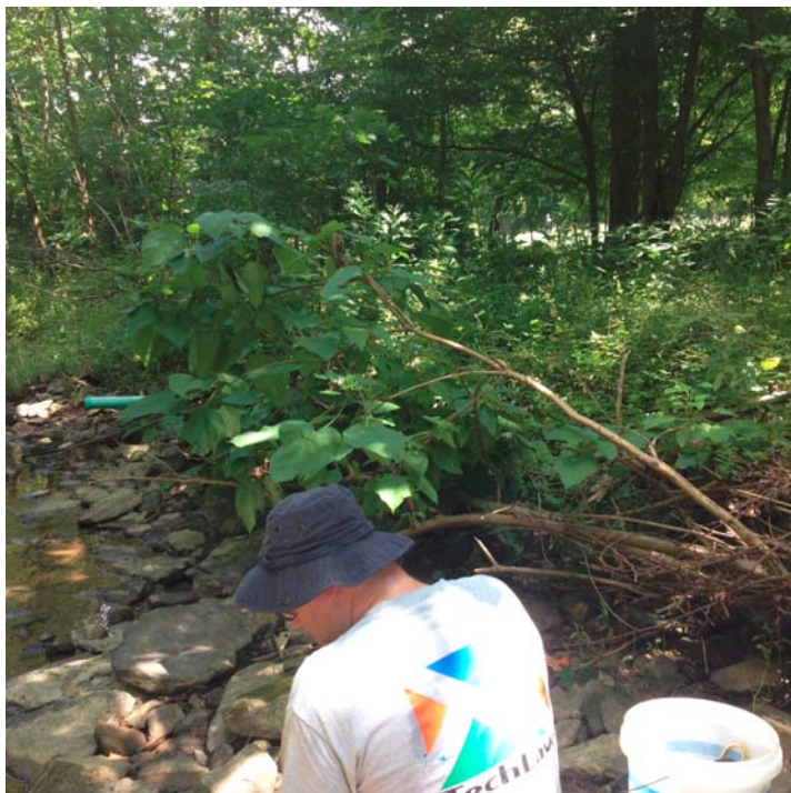
Photo No. IMG_3040; Taken on 07/22/15 at 12:18 hours by START-JW. Facing Down. Location of WG-SW-0007. Teal colored outfall PVC pipe noted downstream from sample location.