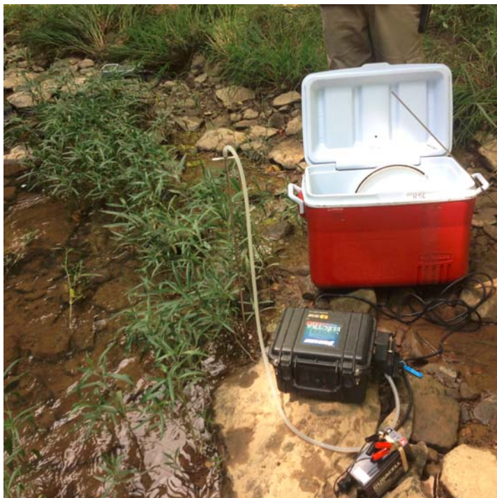
Photo No. IMG_3052; Taken on 07/22/15 at 14:29 hours. Facing Down. Set-up and location of sample WG-PW-0002 and duplicate WG-PW-0003.