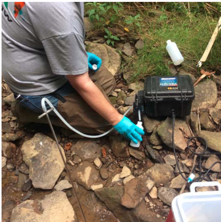
Photo No. IMG_3048; Taken on 07/22/15 at 13:32 hours by START-JW. Facing Down. START collecting WG-PW-0001.