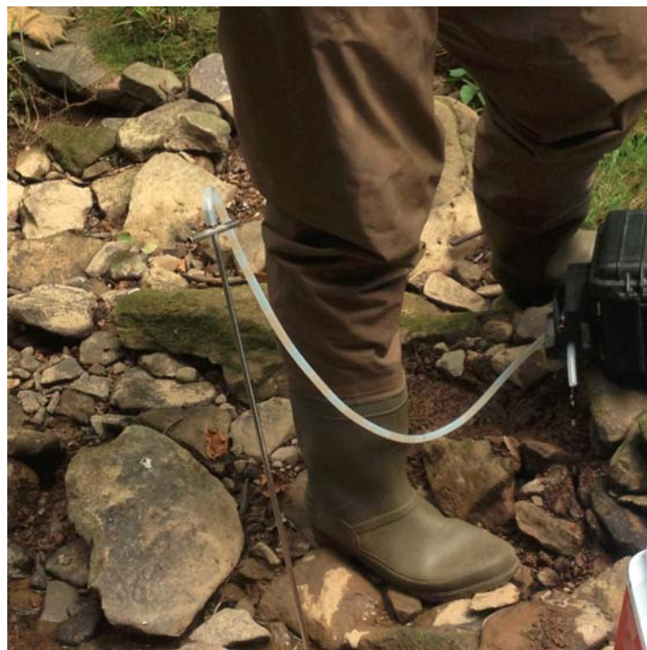
Photo No. IMG_3047; Taken on 07/22/15 at 13:29 hours. Facing Down. Beginning to pump water at WG-PW-0001.