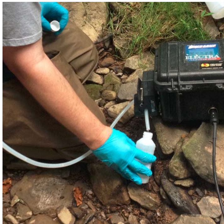
Photo No. IMG_3049; Taken on 07/22/15 at 13:32 hours. Facing Down. Closeup of START collecting WG-PW-0001.