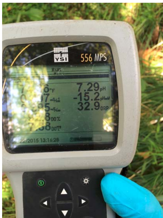
Photo No. IMG_0529; Taken on 07/22/15 at 15:27 hours by START-BH. Facing Down. YSI Meter face. Water quality measurements in stream during sampling of WG-PW-0001.