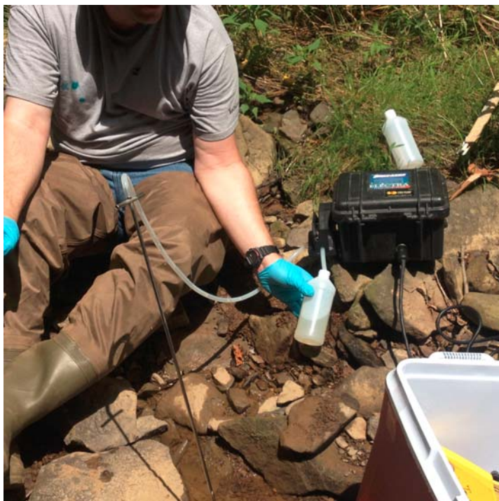
Photo No. IMG_3050; Taken on 07/22/15 at 13:41 hours by START-JW. Facing Down. START collecting WG-PW-0001.