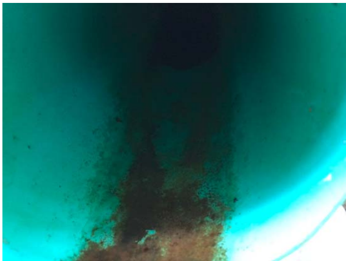
Photo No. IMG_0523; Taken on 07/22/15 at 12:45 hours. Facing N/A. Inside the teal outfall pipe at WG-SW-0007.