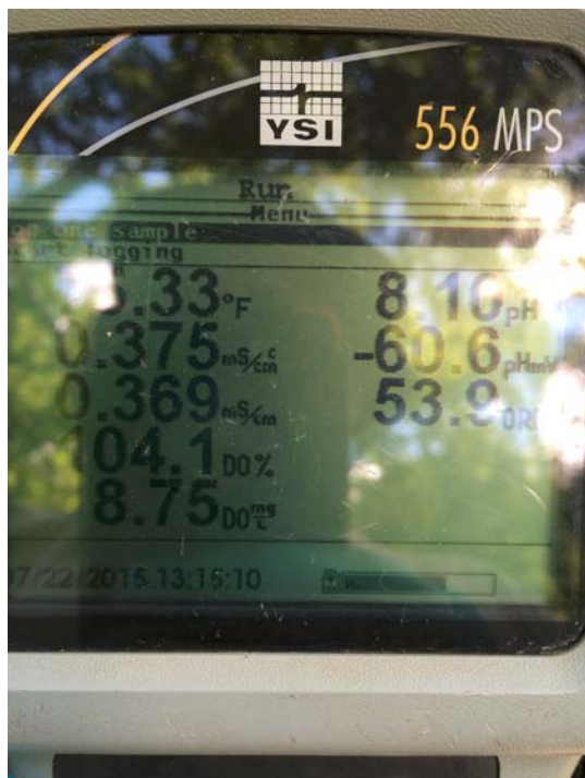
Photo No. IMG_0527; Taken on 07/22/15 at 15:26 hours by START-BH. Facing Down. YSI Meter face. Water quality measurements in stream during sampling of WG-PW-0001.