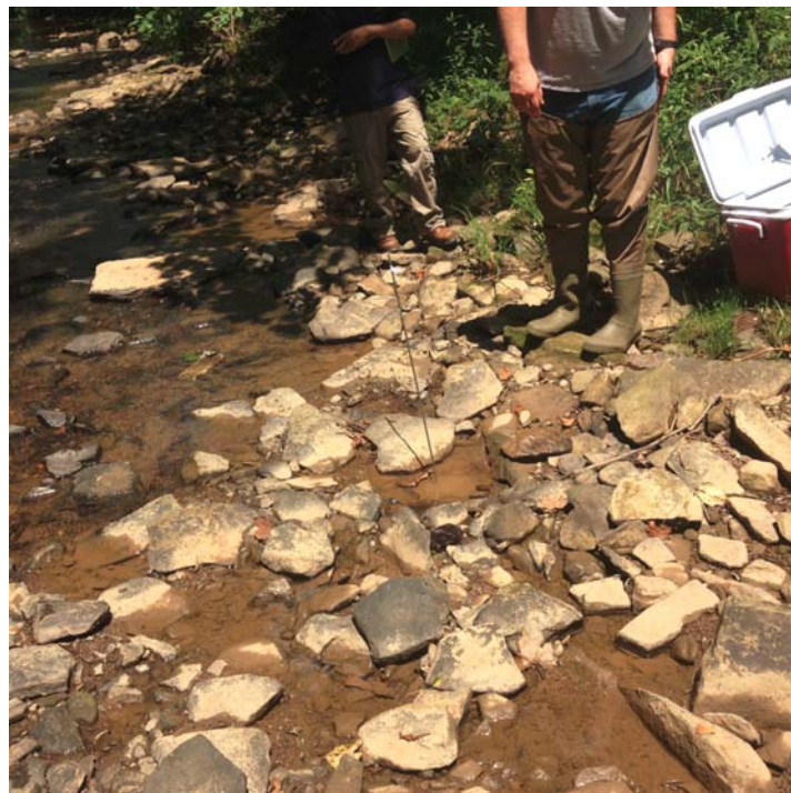
Photo No. IMG_3044; Taken on 07/22/15 at 13:05 hours by START-JW. Facing Down. Location of the sample WG-PW-0001.