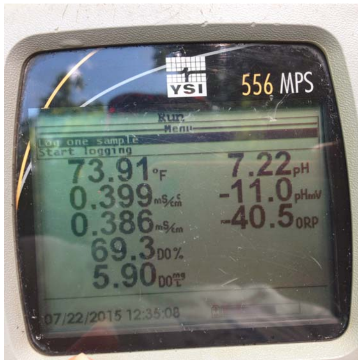
Photo No. IMG_3055; Taken on 07/22/15 at 14:46 hours by START-JW. Facing Down. YSI Meter face. Water quality measurements for sample WG-PW-0002/0003.