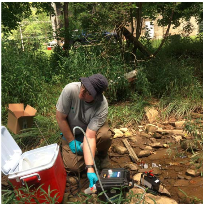
Photo No. IMG_3054; Taken on 07/22/15 at 14:33 hours. Facing Down. START collecting WG-PW-0002 and duplicate WG-PW-0003.