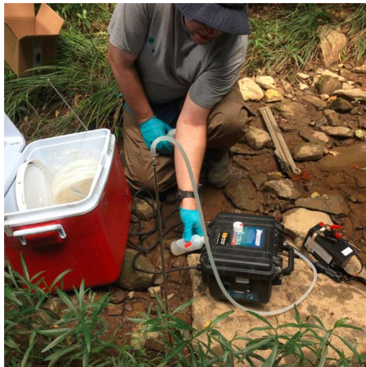
Photo No. IMG_3053; Taken on 07/22/15 at 14:32 hours by START-JW. Facing Down. START collecting WG-PW-0002 and duplicate WG-PW-0003.