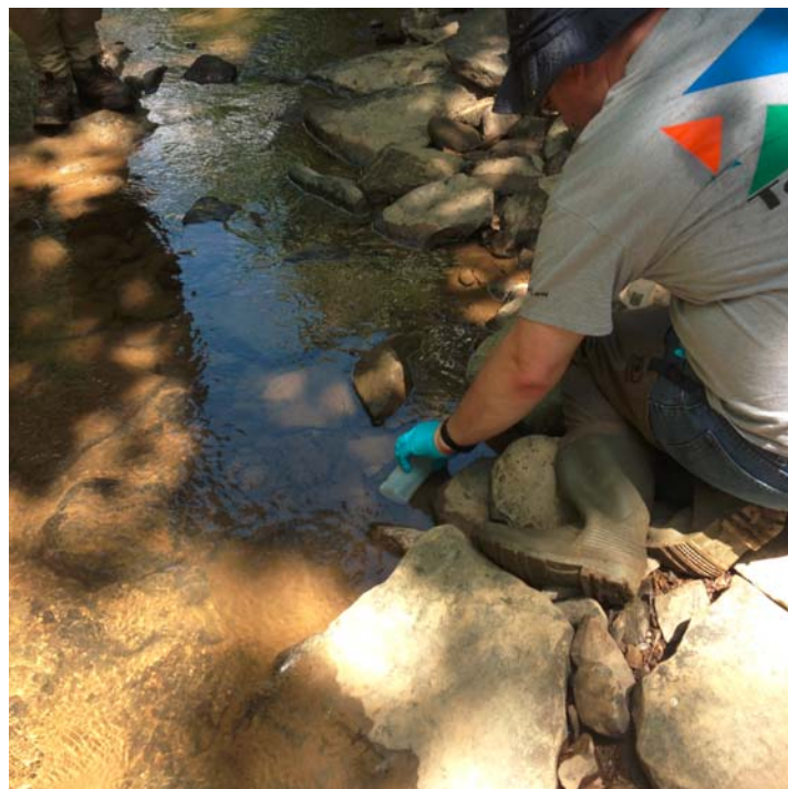
Photo No. IMG_3043; Taken on 07/22/15 at 12:20 hours by START-JW. Facing Down. START collecting WG-SW-0007.