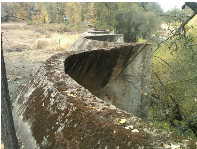
View from the top of the Eastwood Multiple Arch Dam

EPA commissioned the U.S. Army Corps of Engineers (USACE) to evaluate the stability of the dam to determine the risk of release of hazardous contaminants. After a series of investigations, analyses, and reports, USACE has determined the dam to be structurally unstable. A dam failure could result in a landslide containing metals-contaminated tailings and soils. EPA met with federal, state, and local agencies on July 14, 2015 to discuss a plan to address the dam's structural problems. All agencies are in agreement that action should be taken, and are currently determining next steps. EPA will provide an update on behalf of all the agencies at the August 18th community meeting.