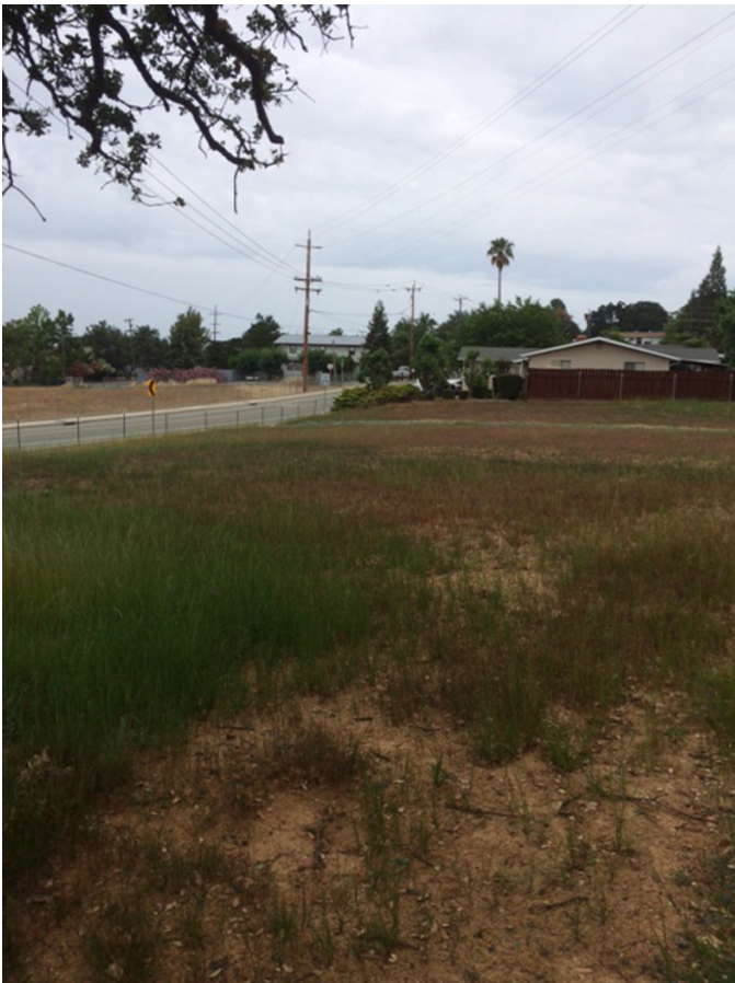
Successful hydro-seeding after the March 2015 cleanup

EPA began work at Jackson Junior High School on July 27 and, at the time of this publication, is expected to complete work before school begins on August 10th. EPA capped the embankment below the athletic field by applying shotcrete. Shotcrete is a process in which compressed air forces wet concrete through a hose at a high velocity and forms a solid, continuous cement wall that conforms to the existing slope. This “cap” will limit potential exposure by direct contact or inhalation pathways. A wire fence will be installed at the bottom of the slope to further limit access after the cleanup is complete.