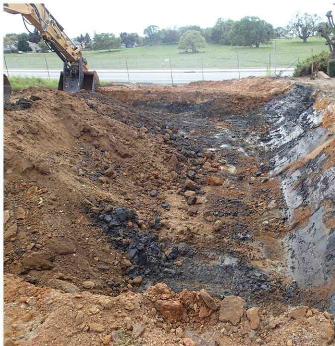
In the midst of the March 2015 excavation