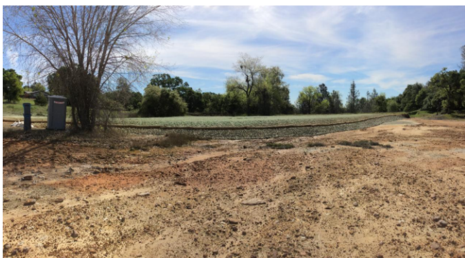
The new soil repository, just after hydro-seeding