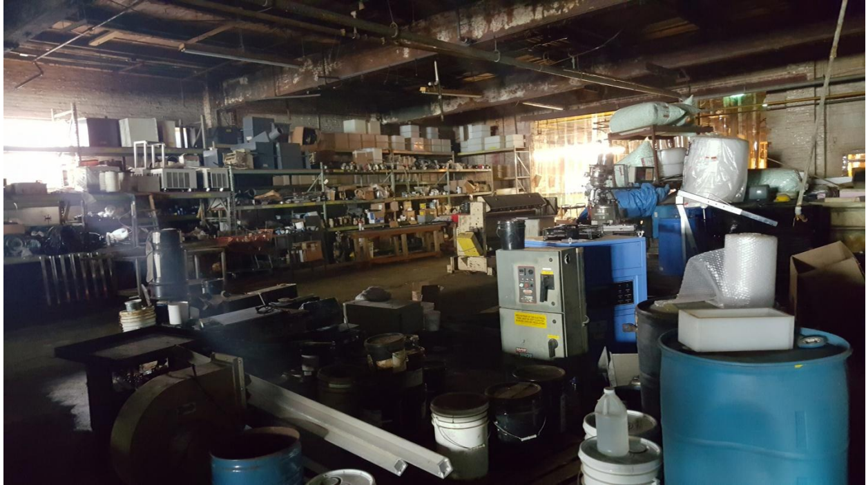
Photo 11 – Shows part of supply area for fiberglass to build custom electroplating tanks along with waste/products from American Plating