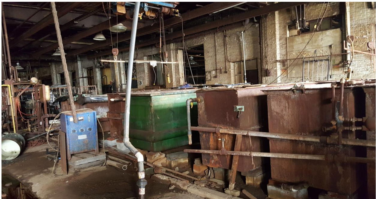
Photo 12 – Shows former American Plating Company electroplating bath tanks