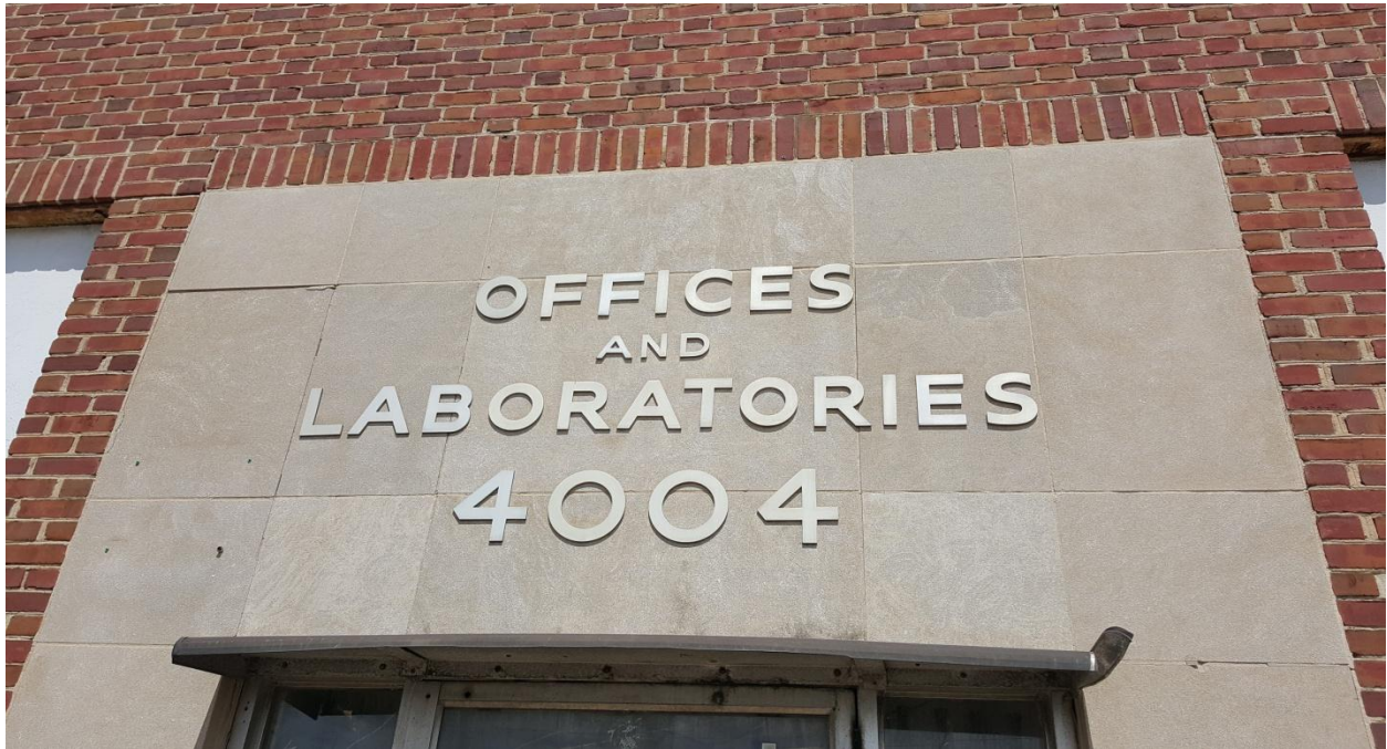
Photo 1 – Front of the former American Plating Corporation, now rented by Artur Nagy trading as Plating & Anodizing Sales