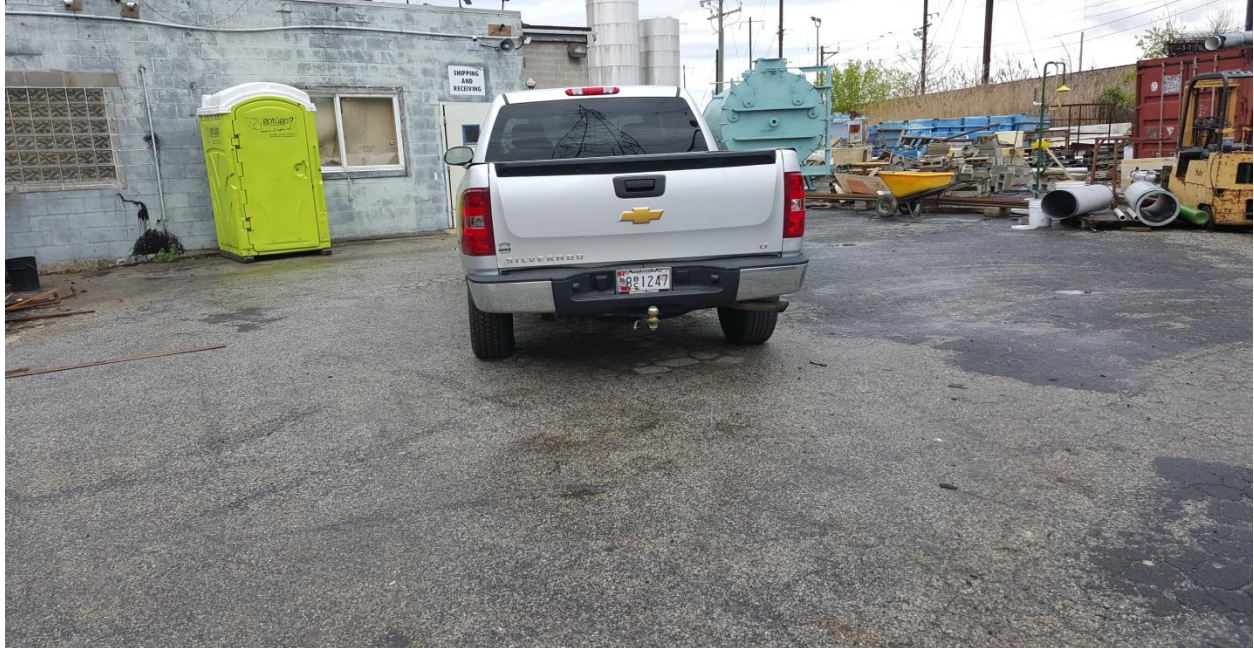
Photo 2 – Rear of the facility showing the office for Artur Nagy and materials outside of the warehouse