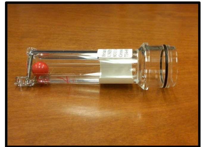
Air Flow Indicator (PN805374-01)