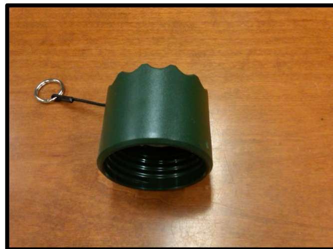
Battery End Cap for C420 Plus (PN31001506)