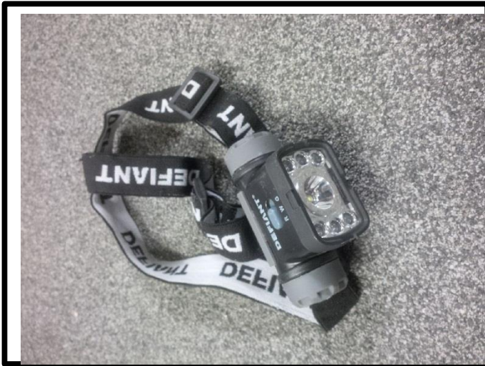
Headlight (Intrinsically Safe)