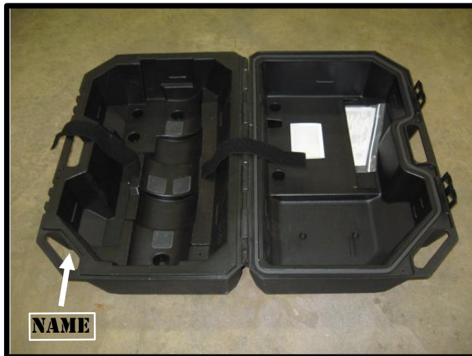
Case for Harness, Mask, Tank w ID Tag (PN804497-01)