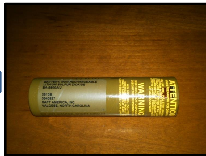
Non-Rechargeable C420 Battery Pack (PN805358-01) Use With End Cap PN 31001506