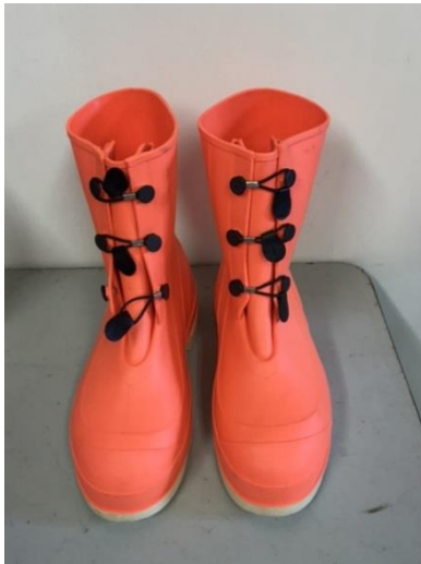
Level A Boots