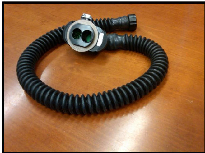
AV PAPR Hose (PN200829-36)