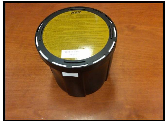
CRRN CAP 1 Canister, 40mm (PN45135)