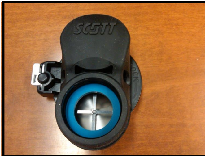
Facepiece Adapter, 40mm CBRN (PN200423-01)