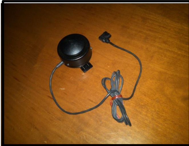
PTT Paddle, EPIC RI (PN200725-01)