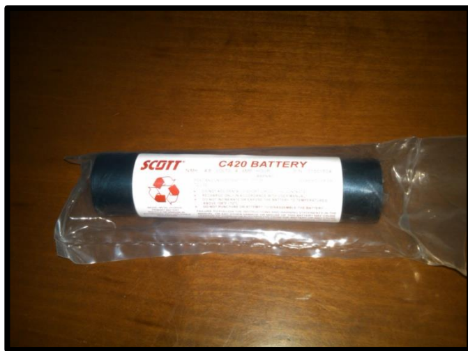
Rechargeable Battery for C420 Plus, NiMh (PN31001504) Use With Battery Charger PN 200703-01