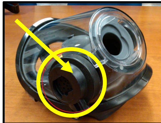
EPIC Comm Bracket AV3000 (PN220715-01)