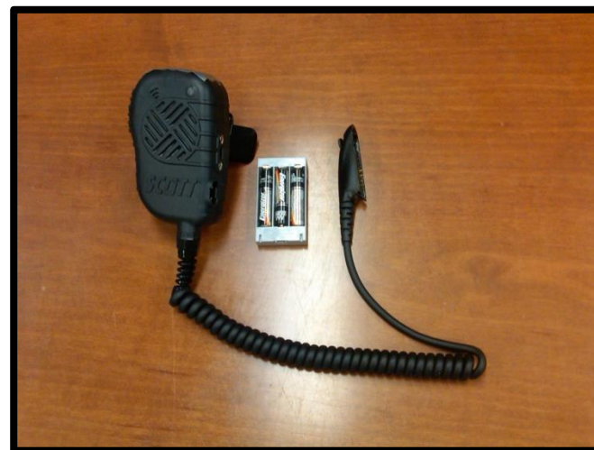
EPIC RI Lapel MIC Assembly (PN200262-04) Contains Three AAA Batteries