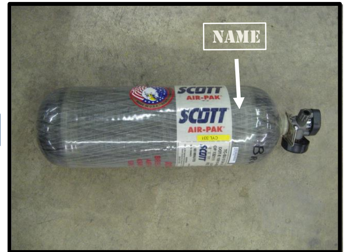
Air Cylinder w Name (PN 10009672)