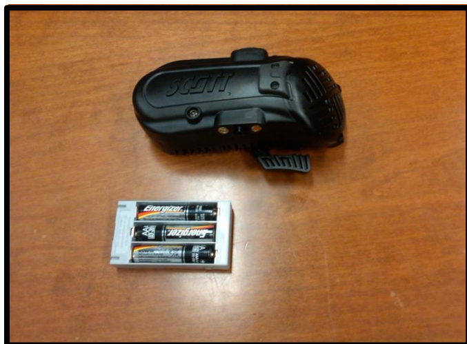
EPIC RI Voice Amplifier (PN200261-01) Contains Three AAA Batteries