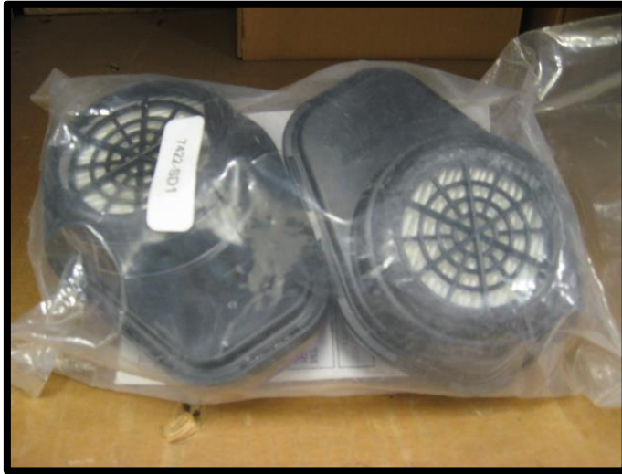
Cartridges P 100 (PN7422-SD1)