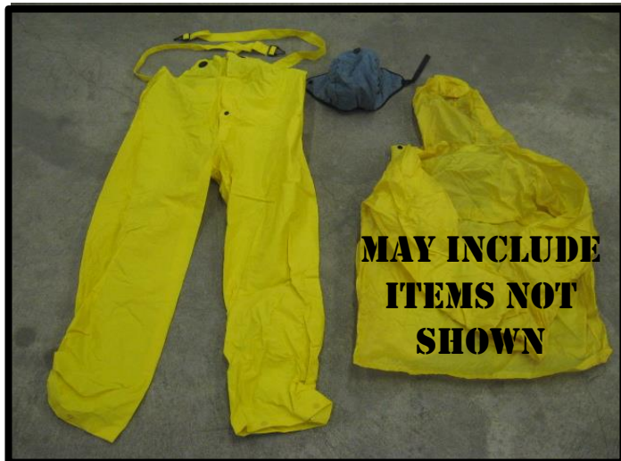
Appropriate Weather Gear