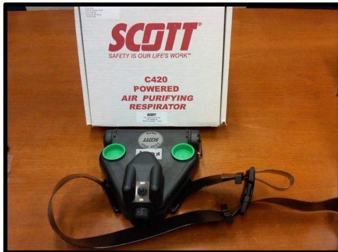
PAPR Kit C420 Plus (PN200698-00)