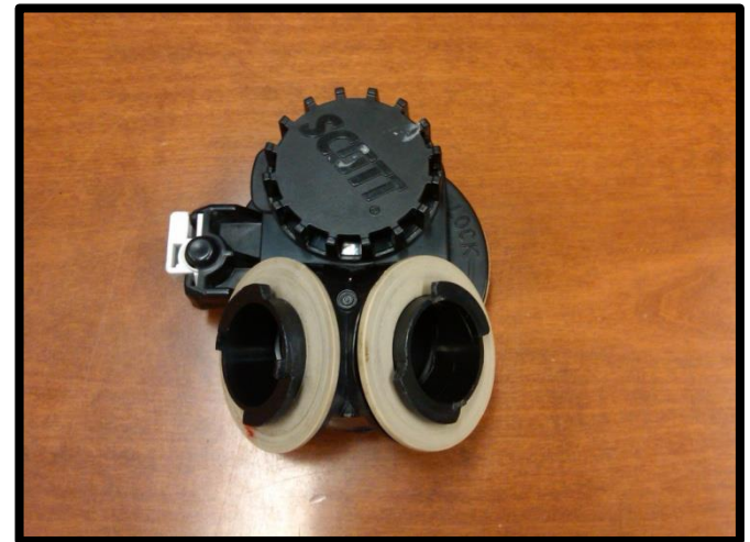
Twin Quarter Turn Adapter (PN805622-01)