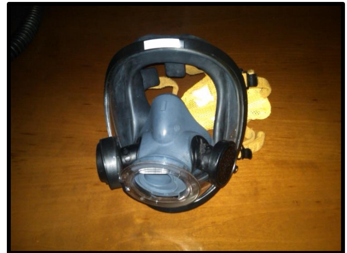
AV-3000 Facepiece (PN805773-83)