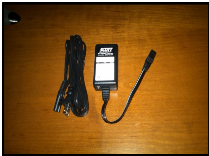
Battery Charger, C420 (PN200703-01)