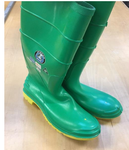
Level B Boots