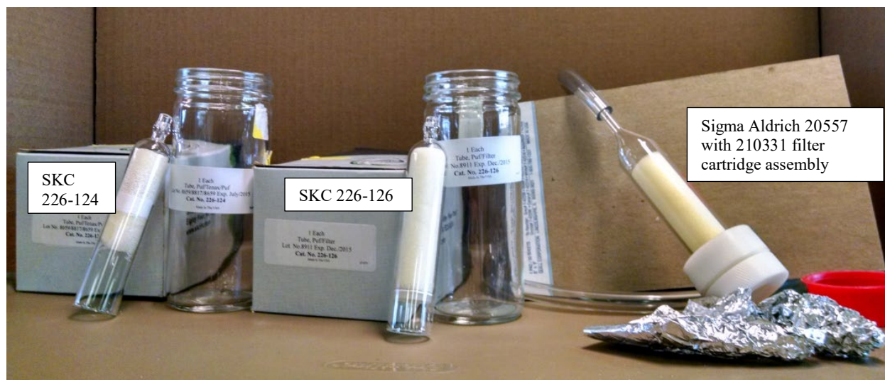
FIGURE 1. Examples of PUF Media

Other media (not pictured) include: SKC 226-143, SKC 226-92 and uncleaned PUF for repacking SKC 226-92.