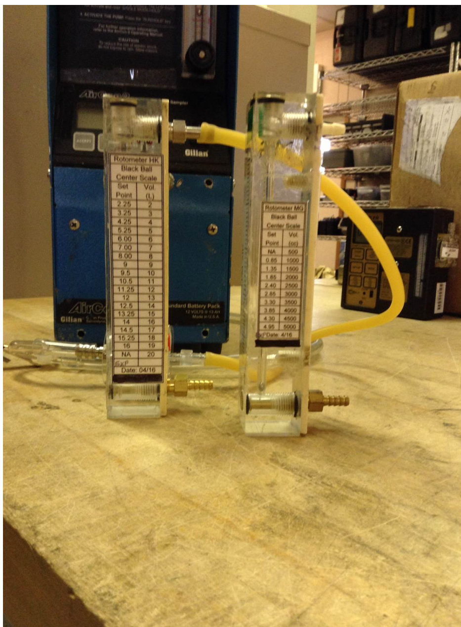
FIGURE 4. Rotameter Flow Rate versus Set Point