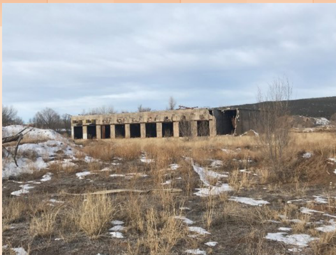
Figure 1: A view of the deteriorating NFPI kiln building to be demolished.

The U.S. Environmental Protection Agency (USEPA) is working with the Red Lake Chapter and the Navajo Nation Environmental Protection Agency (NNEPA) to address asbestos at the former NFPI property. USEPA's work at the former NFPI property will include removing asbestos and demolishing the former wood kiln building. The USEPA is doing this work to prevent community's exposure to the asbestos on the property.