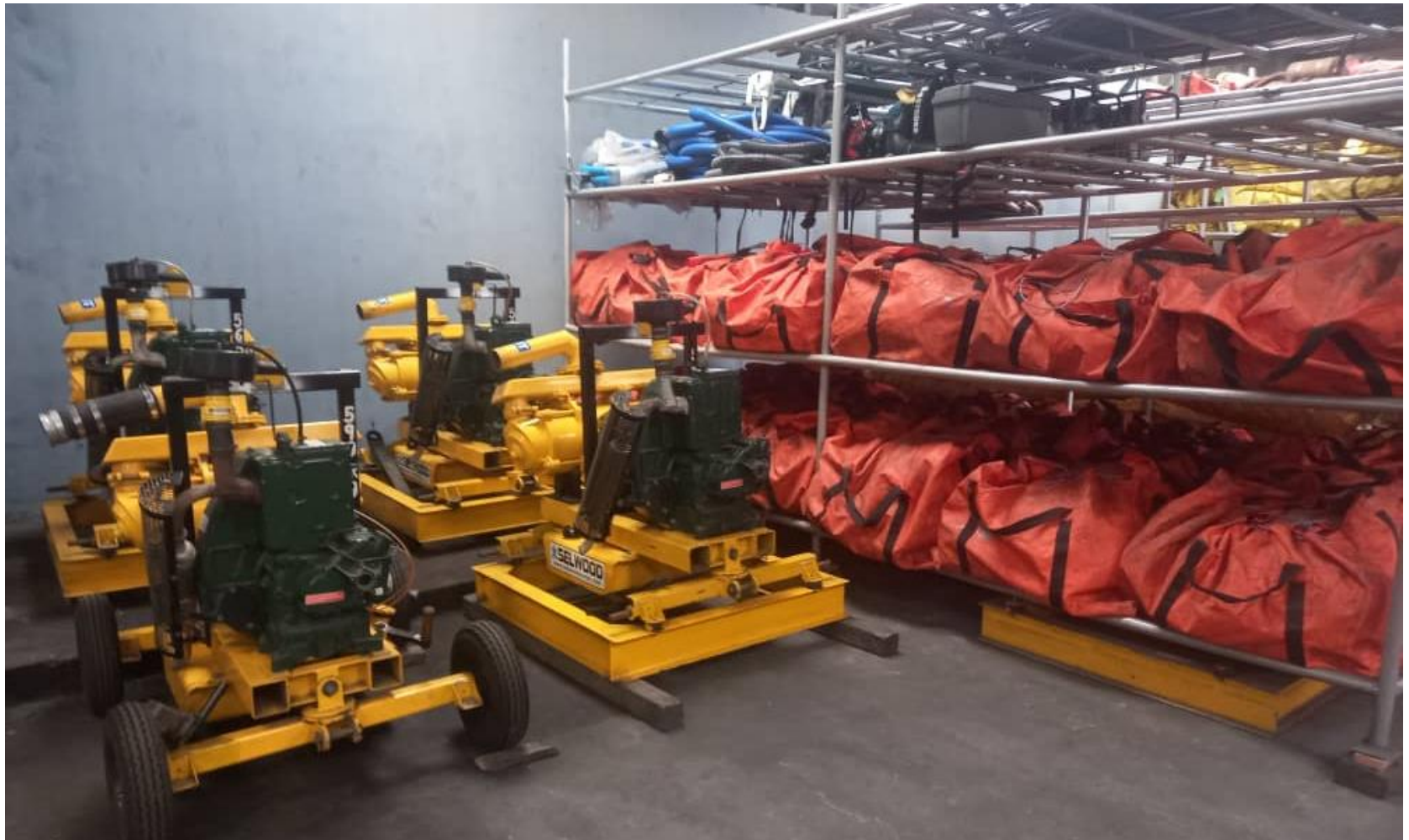
COMPREHENSIVE EQUIPMENT STOCKPILE