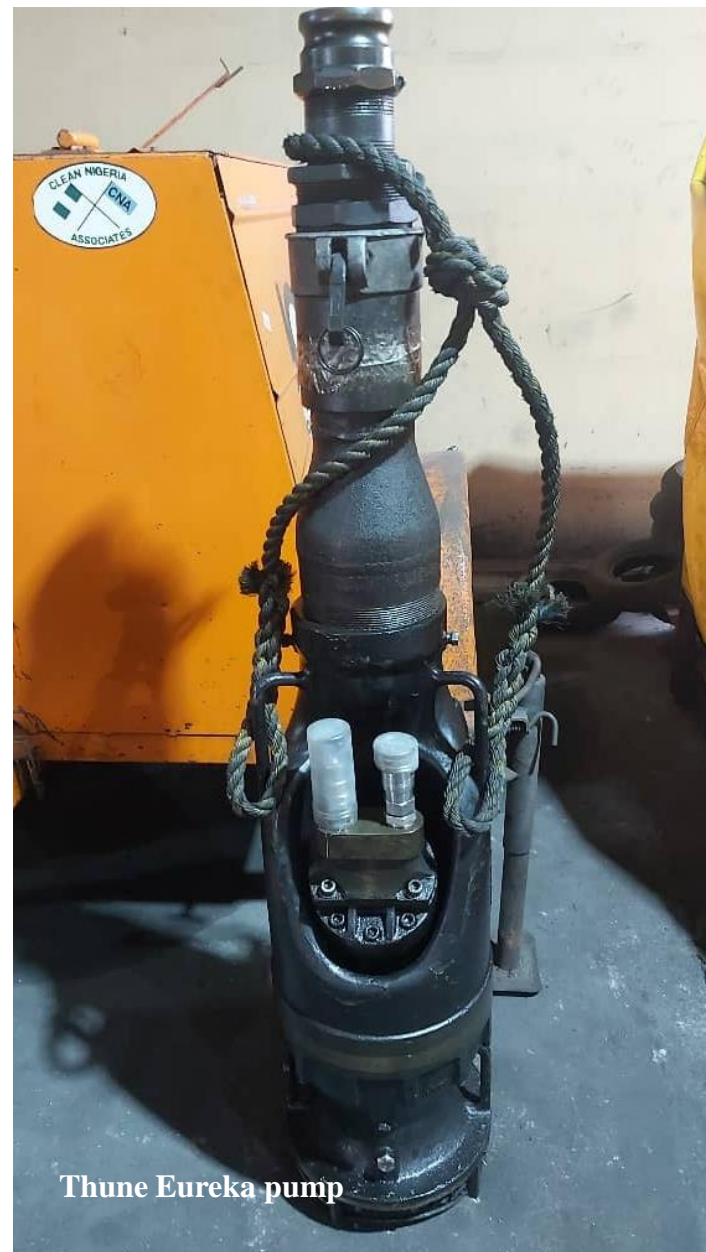
Thune Eureka pump