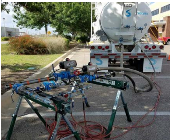
Demonstration of Integrated E-Stop Unit