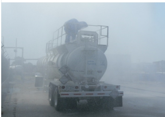
Application of Capping Kit Under Deluge