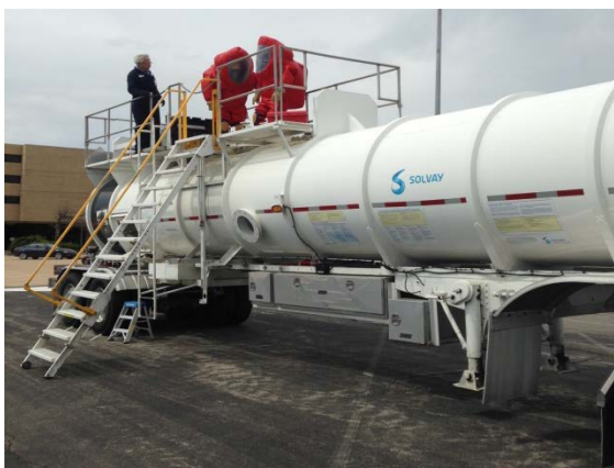
Application of Capping Kit In Level “A” PPE

Solvay Fluorides, LLC is pleased to offer the industry its award winning and innovative Anhydrous Hydrogen Fluoride training trailer. This training tool greatly enhances our ability to properly train refinery personnel for the safety and emergency response requirements associated with the handling of Anhydrous Hydrogen Fluoride. It offers “hands-on” training for trailer operating features and valve capping, and can be used to test refinery “Haz-Mat” emergency response readiness.