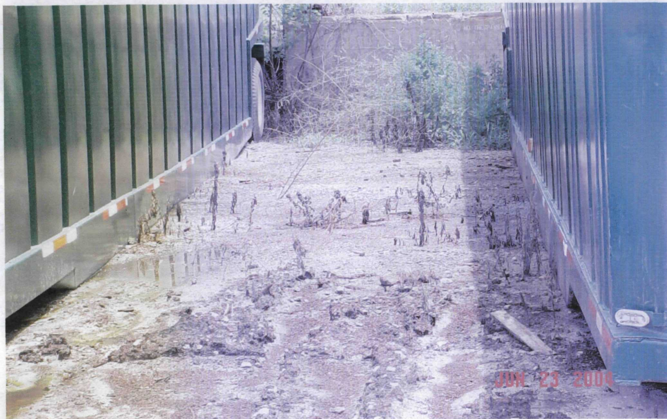
Dead vegetation between the storage tanks