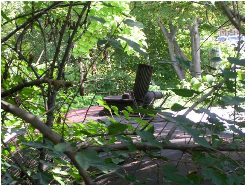
SCENE: View of Tank 1; sample location DP-06. Photograph taken facing east.