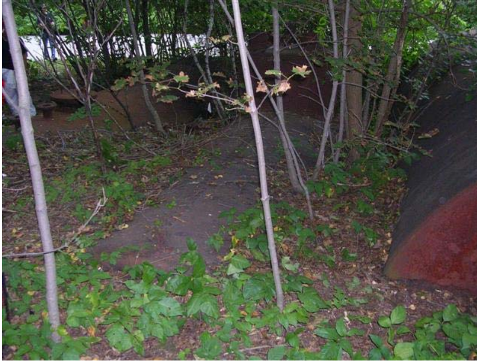
SCENE: View of Tanks 1, 2, and 3. Photograph taken facing east.