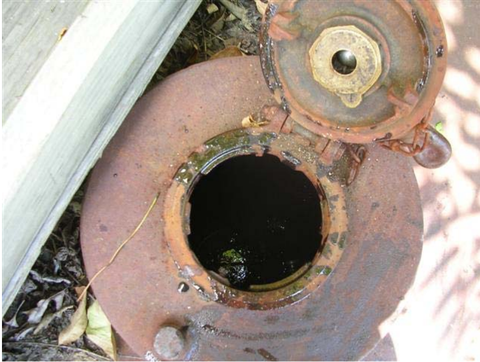
SCENE: View of the opening on Tank 4; sample location DP-08.