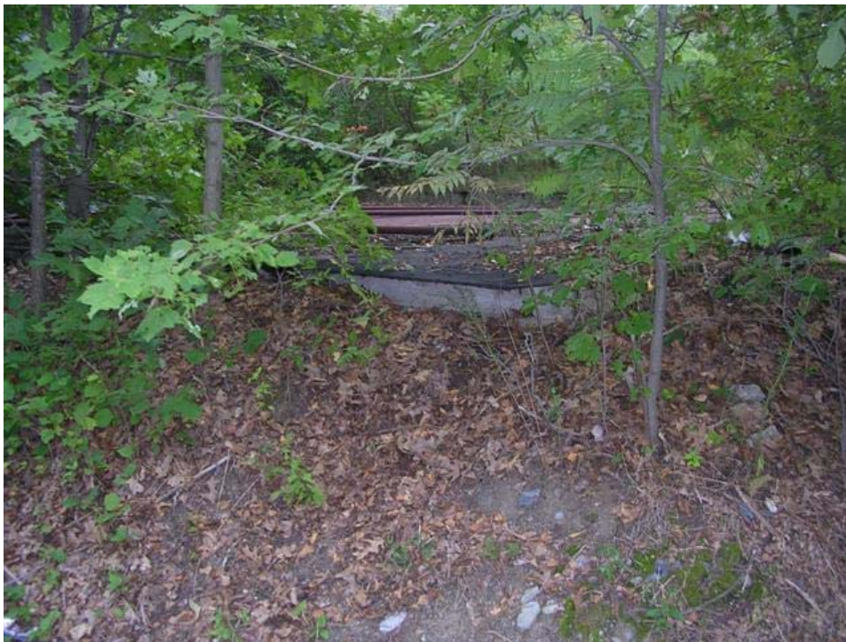
SCENE: View of the 75K bunker and sample location SS-13. Photograph taken facing southwest.