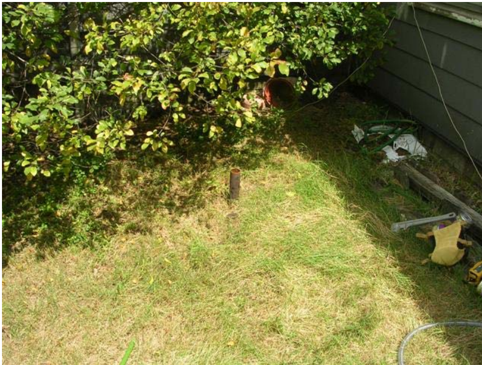
SCENE: View of the fill pipe on Tank 6; sample location DP-09. Photograph taken facing southeast.