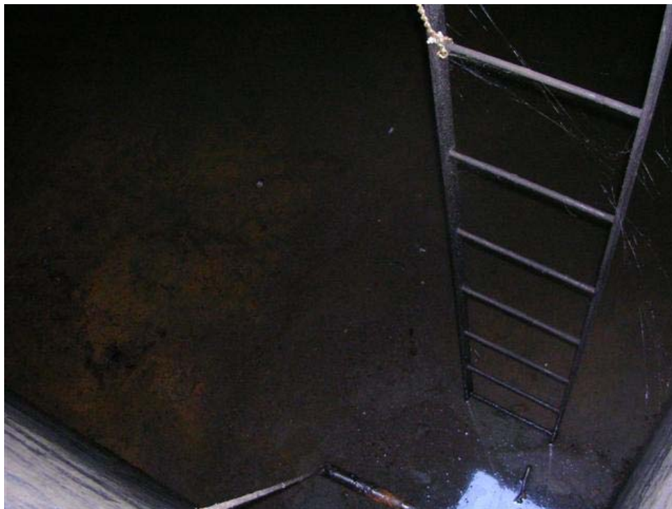
SCENE: View of the 75K bunker interior from hatch; sample location DP-01.