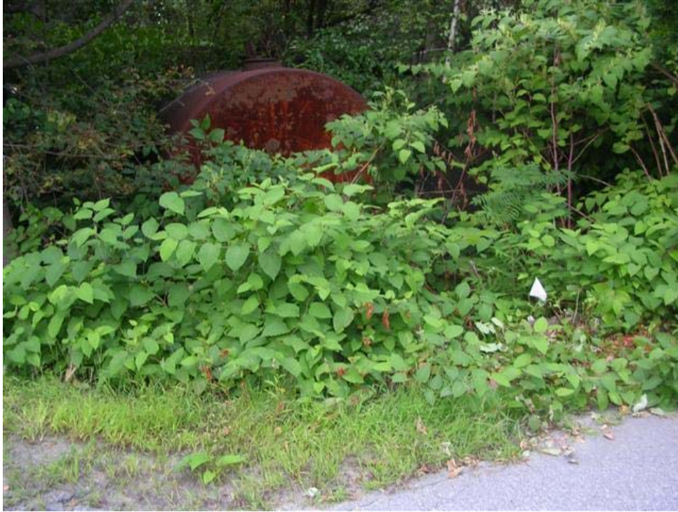
SCENE: View of Tank 1 and sample location SS-49. Photograph taken facing west.