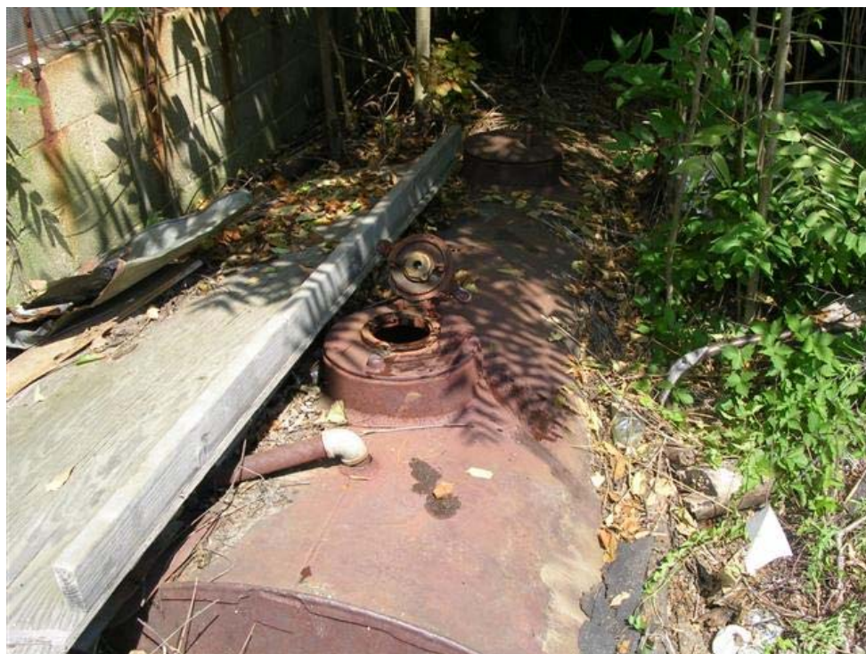
SCENE: View of the opening to Tank 4; sample location DP-08. Photograph taken facing east.