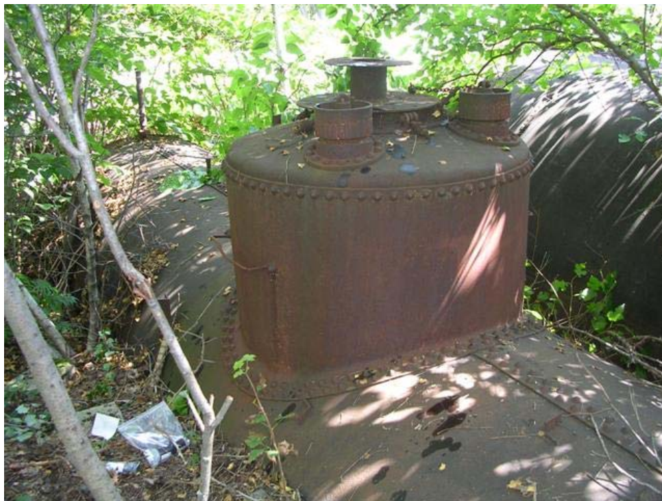
SCENE: View of Tank 2; sample location DP-05. Photograph taken facing southeast.