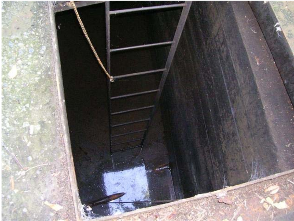
SCENE: View of the 75,000-gallon (75K) bunker interior from hatch; sample location DP-01.