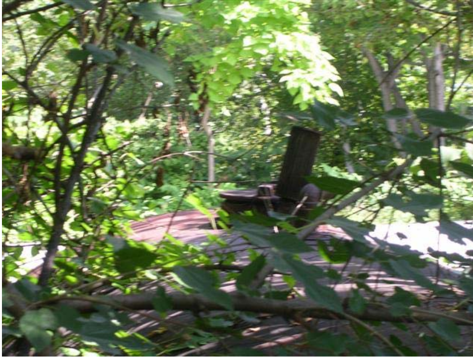
SCENE: View of Tank 1; sample location DP-06. Photograph taken facing east.