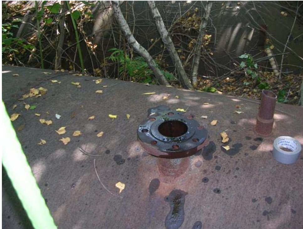
SCENE: View of the opening to Tank 3; sample location DP-04. Photograph taken facing south.