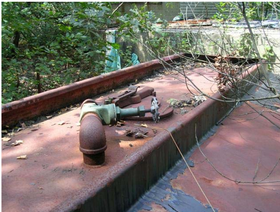
SCENE: View of the top of the Tank Truck; sample location DP-07. Photograph taken facing northwest.