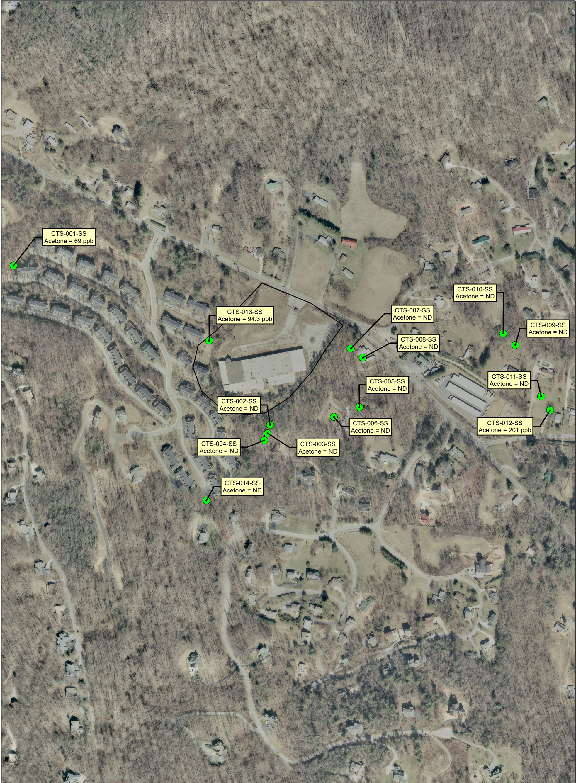
2006 AERIAL IMAGERY PROVIDED BY BUNCOMBE COUNTY GIS

Disclaimer: This map is intended for visual orientation use only. In no way is this map to be used for precise locational use.