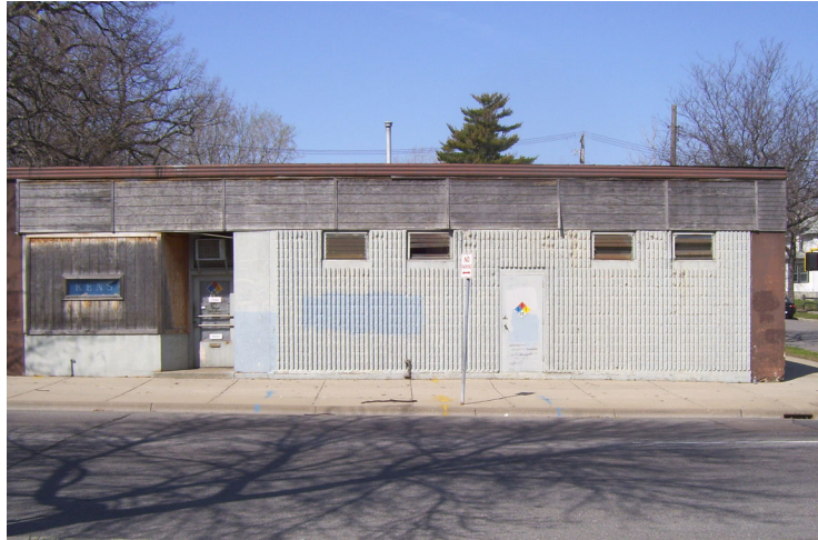
Ken's Metal Finishing is in the process of being cleaned up by EPA.

Hennepin County Library North Regional Library 1315 Lowry Ave. N. Minneapolis