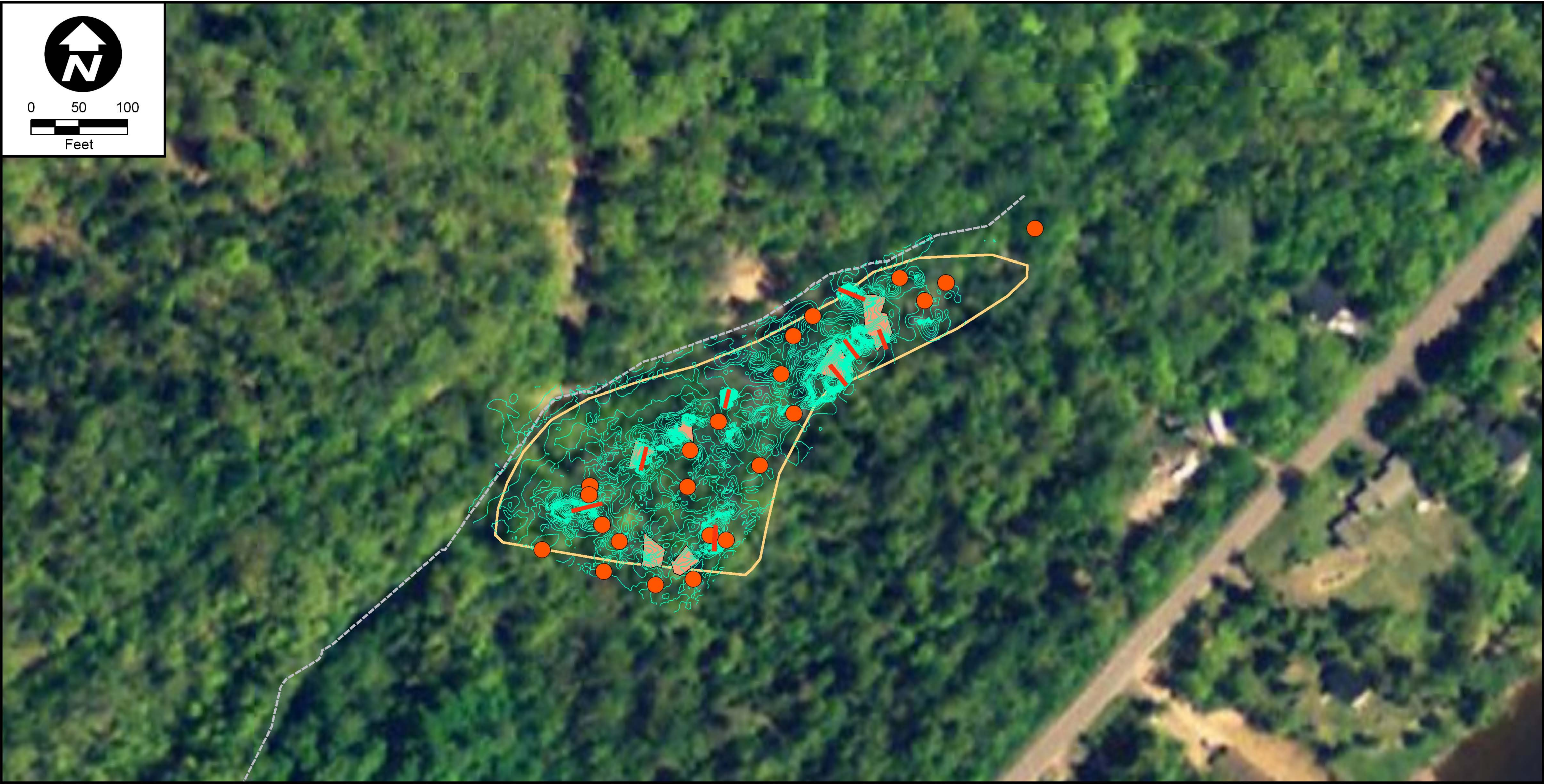
Orthophotograph taken 2005