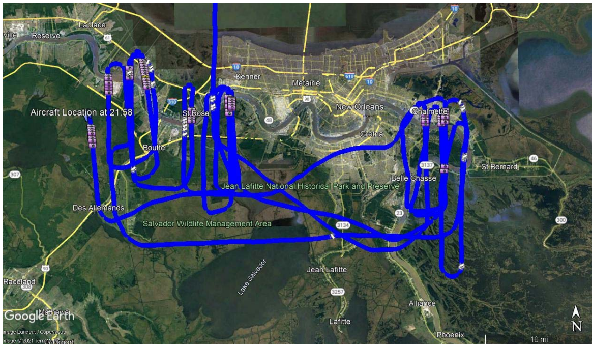
Figure 2. Data Collection Flight Path, St. Bernard, Terrebonne, St. Charles, and St. James, Flight 12, September 8, 2021