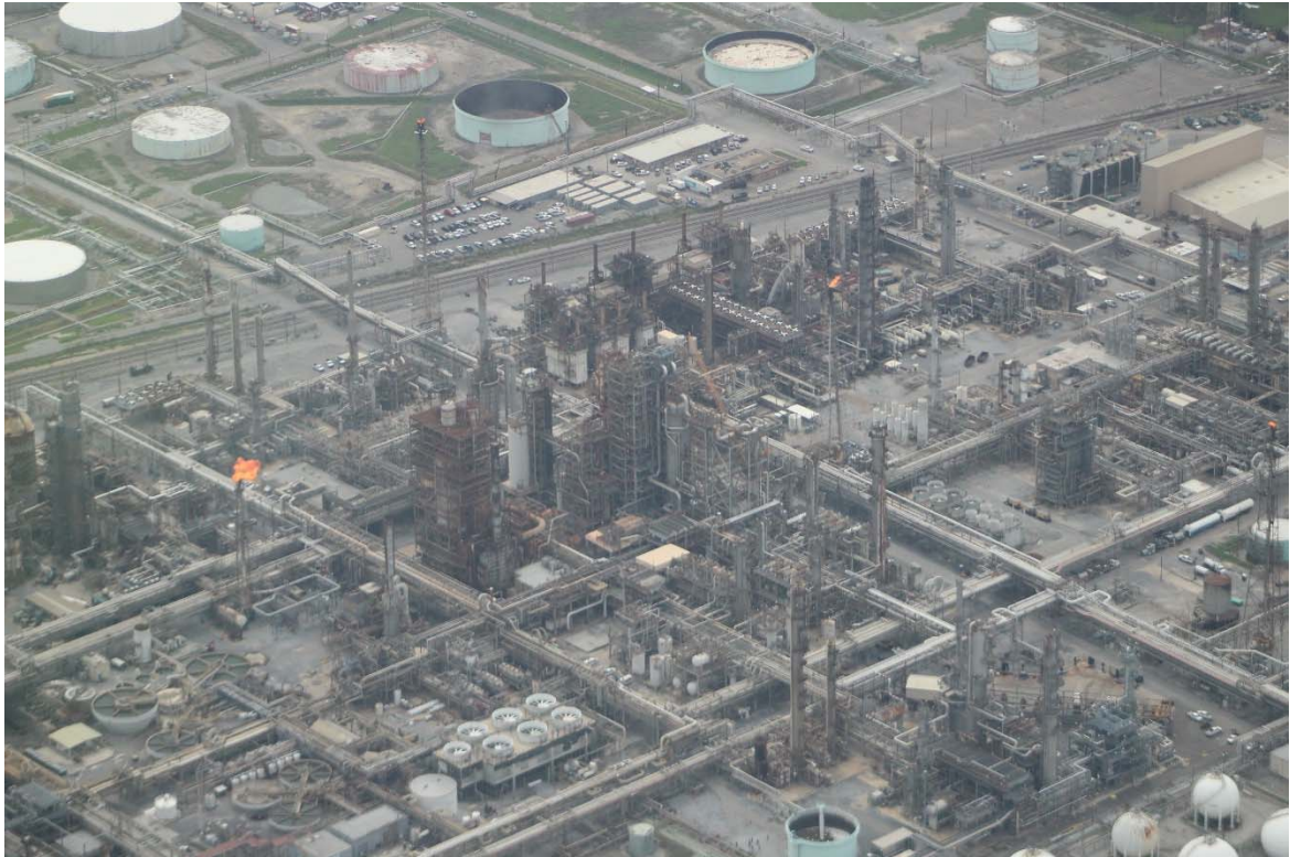
Figure 6. Oblique photo of the Valero Meraux Refinery, Flight 12, September 8, 2021