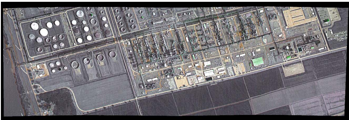
Figure 3. Three band IR image, Equilon Enterprises LLC dba Shell Oil Products US - Convent Refinery, Flight 11, September 8, 2021

A total of 21 data collection runs (2 tests and 19 active) were made over the target facilities and an infrared line scanner image was generated for each collection run. Figure 3 shows a 3-band infrared image collected over the Shell Convent refinery. Analysis of the image shows elevated piping and hot units in the main process section of the facility. No discharges can be seen leaving the facility. Figure 4 shows a similar image collected over the Valero Refining Meraux Refinery. Hot flares in the lower portion of the image in addition to some hot process piping is evident.