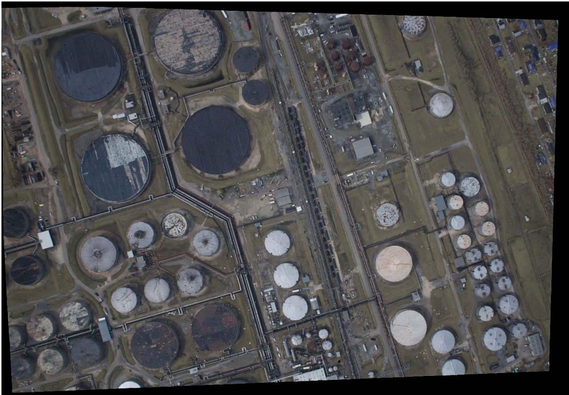
Figure 5. MSIC image of the St Rose Refinery LLC - St Rose, Flight 12, September 8, 2021

A full set of high-resolution aerial digital photography were collected as part of each data collection pass. As with the missions on September 7, flight conditions were complicated by low ceiling and convective activity. An aerial image of the St. Rose refinery is given in Figure 5. No significant damage or activity is evident in the image. An oblique image of the Valero Meraux Refinery is shown in Figure 6. As indicated in IR images of the same facility, two flares can be observed indicating some activity within the facility.